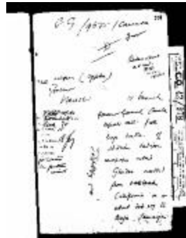
[Harcourt to Governor General, Canada, with related material] (2021_07_5279)