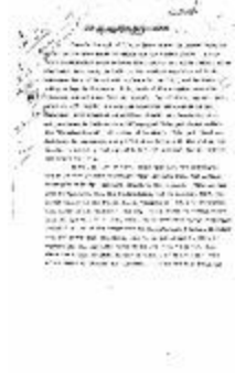
Note on the Hindu Revolutionary Movement in Canada (2021_07_5232)