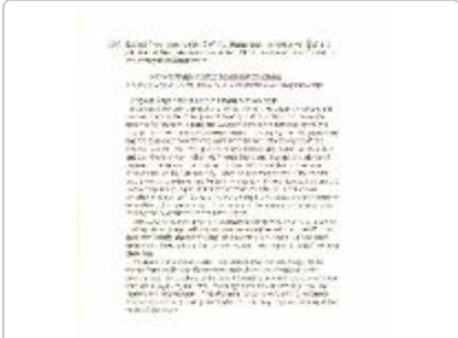
Why was Bhagwan Singh deported from Canada: the disloyalty of the Hindustanis who helped to deport Bhagwan Singh