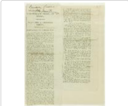
Newsclipping - Conspiracy trial in India (2021_07_10787)