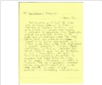
Newsclipping - San Francisco Examiner: [article on Har Dayal] (2021_07_10326)