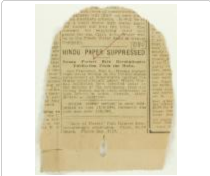
Newsclipping - Hindu paper suppressed (2021_07_10810)