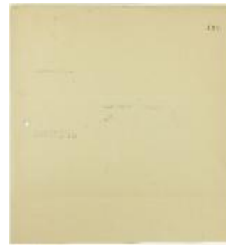
Copy of translated extracts of 'The Mutiny' No. 14. Cover-page 2 (2021_07_9384)