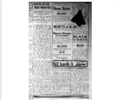
Newsclipping - Vancouver Sun: Sohan will not read naughty mutiny paper. Page 2 (2021_07_10457)