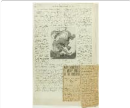
Newsclippings - American-made Hindu revolts; Warn women not to marry Hindus or the Moslems (2021_07_10786)