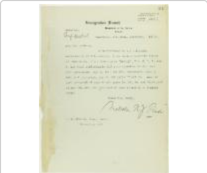
Letter from Malcolm Reid to Stevens enclosing translations of the Hindu paper 'Mutiny' (2021_07_10655)