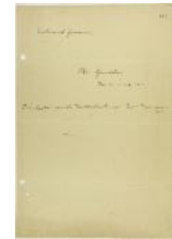
Translations of extracts from 'The Mutiny' (Guddre) [Nos. 9, 10, 11, 12, and 13], printed and published in San Francisco