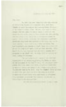
[Correspondence re recent incidents (see pp. 381-385)] Page 1-3 (2021_07_320)