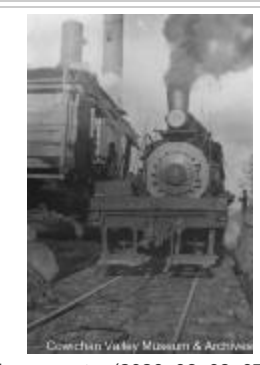
Taking on water (2020_06_08_07_003)