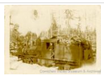
One of the Mayo Company trains : a wood burner (2020_06_08_06_009)