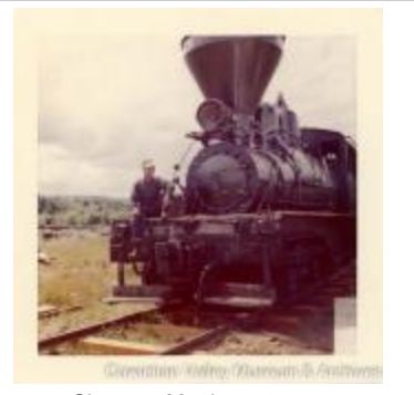
Clarence Martin on 3 spot (2020_06_08_08_005)