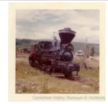
The 3 spot locomotive company store in background (2020_06_08_08_003)