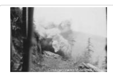
Blasting for R/R on Hill 60 (2020_06_08_003)