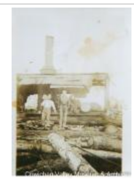
The "duplex" (2020_06_08_05_001)