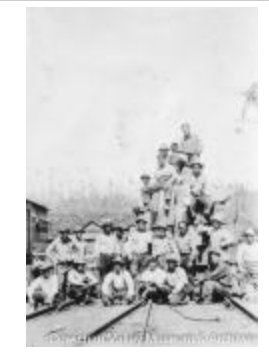
[Unidentified group of men posing for a photo on the railroad] (2020_06_08_01_004)