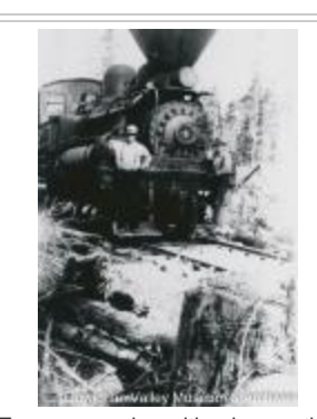
Two men posing with a locomotive (2020_06_08_07_001)