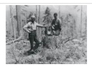
Matsusiro Yamada (2020_06_08_01_001)