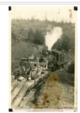
Moving heavy equipment and logs at Kapoor operation (2020_06_08_06_001)