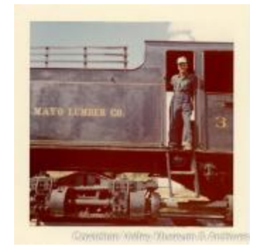
Clarence Martin on 3 spot (2020_06_08_08_007)