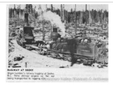
Mayo Lumber Co. locomotive transporting a donkey engine (2020_06_08_06_005)