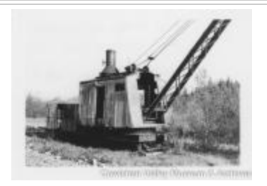
Vintage self propelled steam crane at Paldi (2020_06_08_03_005)