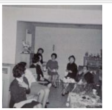
[Photo of a group of women sitting inside a house] (2023_09_01_01_03_006)