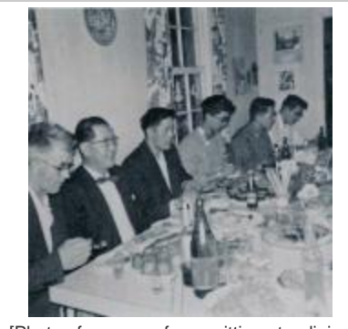
[Photo of a group of men sitting at a dining table] (2023_09_01_01_03_011)