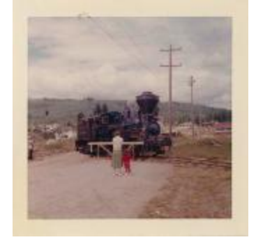
[Photo of a steam engine crossing a street in Paldi, B. C.] (2023_09_01_01_08_004)