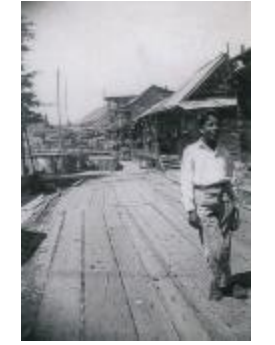
[Photo of a boy standing on the boardwalk, Paldi, B.C.] (2023_09_01_01_12_009)