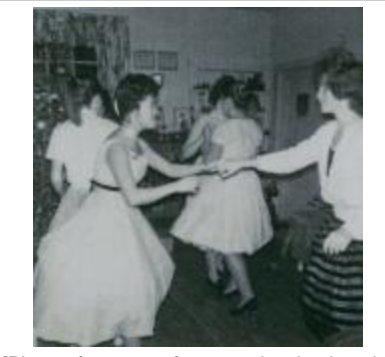
[Photo of a group of women dancing in pairs inside a house] (2023_09_01_01_03_008)