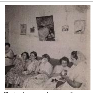
[Photo of a group of women sitting on a sofa] (2023_09_01_01_03_007)