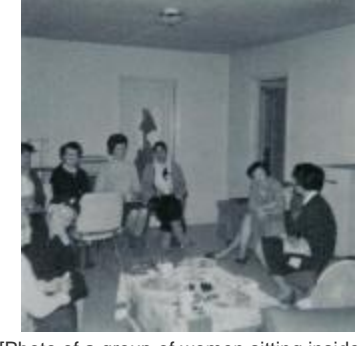
[Photo of a group of women sitting inside a house] (2023_09_01_01_03_025)