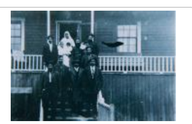
[Photo of a group of people standing outside Paldi Gurdwara] (2023_09_01_01_12_008)