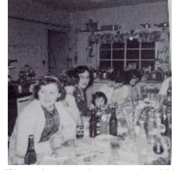
[Photo of a group of women and a child sitting at a dining table] (2023_09_01_01_03_001)