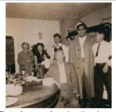
[Photo of a group of people gathered around a dining table] (2023_09_01_01_03_010)