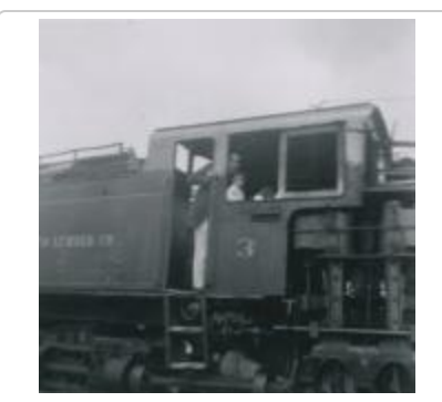
Photo of Rajindi Mayo with a child on a steam engine] (2023_09_01_01_08_002)