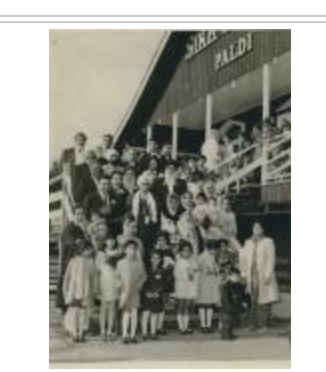
[Photo of a group of people standing on the staircase of Paldi Gurdwara] (2023_09_01_01_12_040)