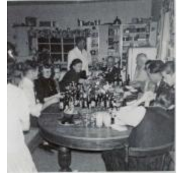
[Photo of a group of men and women sitting at a dining table] (2023_09_01_01_03_005)