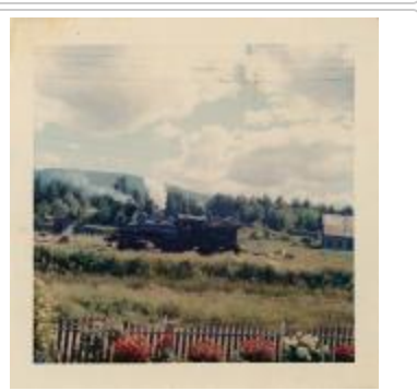
[Photo of a steam engine running on the tracks] (2023_09_01_01_08_009)