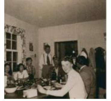
[Photo of a group of people at a dining table] (2023_09_01_01_03_009)