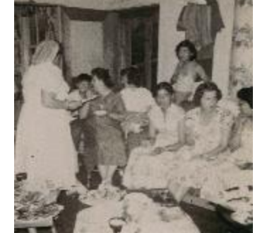
[Photo of a group of women in a living room] (2023_09_01_01_03_002)