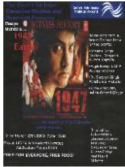
[Centre for Indo-Canadian Studies: Film screening of 1947 Earth] (2022_01_01_01_006)