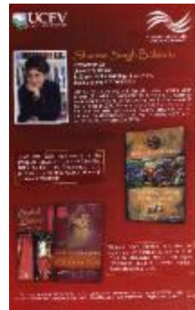
[Poster titled, Shauna Singh Baldwin public book reading and signing] (2022_01_01_01_008)