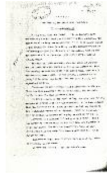
[Komagata Maru passengers committee to the Editor, the Daily News Advertiser, Vancouver] (2021_07_4682)