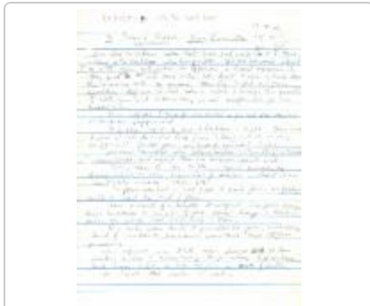
[Committee K. M. to Immigration Agent, Vancouver] (2021_07_10386)