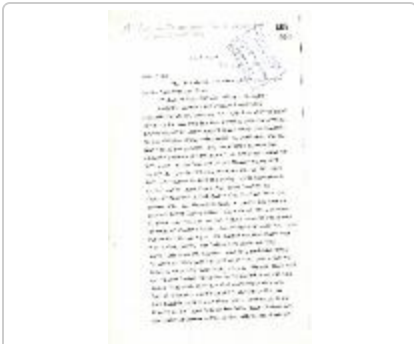
Letter for the newspapers from a passenger on the Komagata Maru (2021_07_5202)