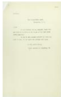
Letter from Passengers Committee to Reid re provisions (2021_07_10927)