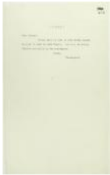
Covering letter re following account to be submitted to newspapers (2021_07_10780)