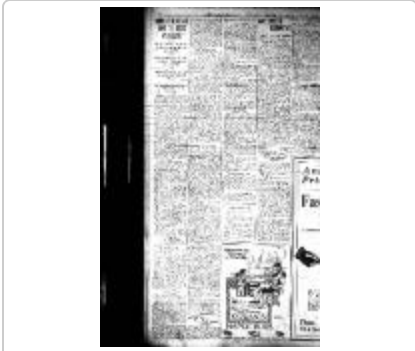
Newsclipping - Vancouver Daily Province: Hindus threaten to take to boats and escape (2021_07_10497)