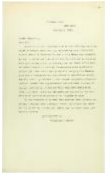
[Copy of letters enclosed with pp. 409-411 - letter from Reid to W. D. Scott re activities of J. E. Bird] (2021_07_604)