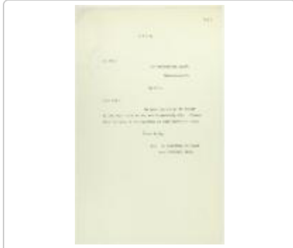
Copy of letter from Committee on ship to Reid re sickness (2021_07_10738)