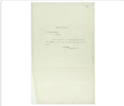
Copy of telegram, signed Passengers, sent to Governor General re shortage of water (2021_07_10703)