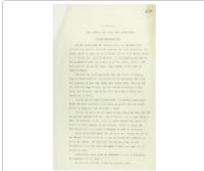
Copy of letter sent to Editor, The Daily News Advertiser, by passengers on board the Komagata Maru. Page 1-3 (2021_07_9475)