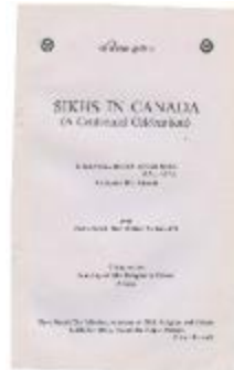
Sikhs in Canada (a centennial celebration) (2020_04_006_001)