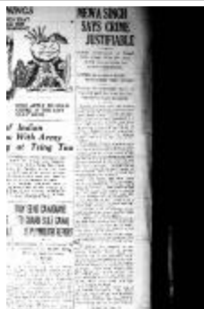
Newsclipping - Vancouver Sun: Mewa Singh says crime justifiable (2021_07_5122)