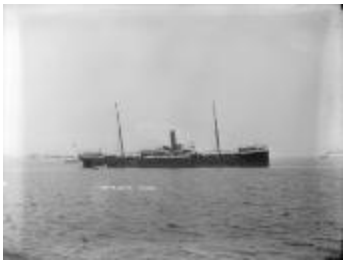
['Komagata Maru' in Vancouver harbour] (2021_07_10624)

Handwritten letter on aged paper, discussing the detention of Hindus at Sumas and enclosing a statement.