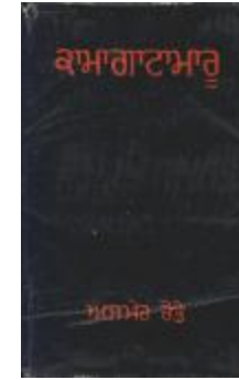
Kamagata Maru (full play) (2021_07_1878)