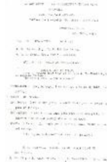
In the court of Oyer & Terminer & General Gaol Delivery. Vancouver Fall Assizes. (Before The Honorable Mr. Justice