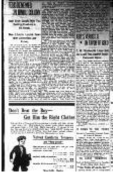
Newsclipping - Vancouver Daily Province: Feud renewed in Hindu colony. Page 3 (2021_07_10467)