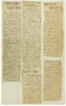
Newsclippings - Serious charge against Hindus; Charge of murder laid against Hindu; Hindu sues bank, queer story told;