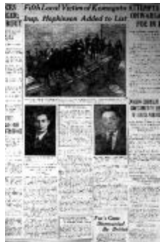
Newsclipping - Vancouver Sun: Fifth local victim of Komagata: Insp. Hopkinson added to list (2021_07_5110)