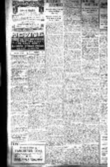
Newsclipping - Vancouver Daily Province: Swear Sohan Lal incited murder (2021_07_10464)