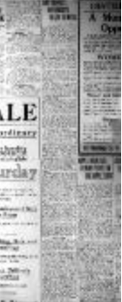
Newsclipping - Vancouver World: Jury charges Hopkins's death to Mewa (2021_07_10453)