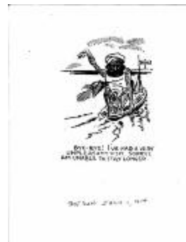
Bye-bye! I've had a very unpleasant visit. Sorry I am unable to stay longer. (2021_07_10822)