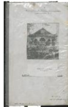
Khalsa Diwan Society [Diary], Vancouver, B.C. [Volume 1 - English translation] (2021_07_10918)