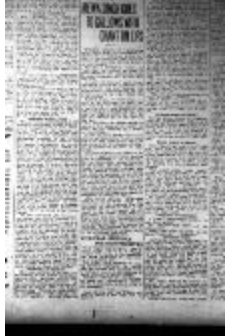
Newsclipping - Vancouver World: Mewa Singh goes to gallows with chant on lips. Page 2 (2021_07_10466)