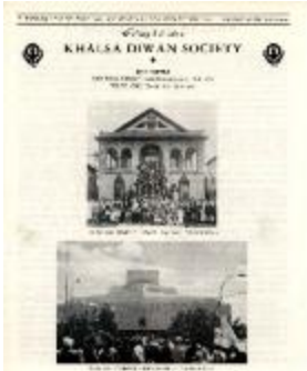
Khalsa Diwan Society (2020_04_004_036)