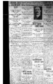
Newsclipping - Vancouver Daily Province: Gurdit Singh won't pay up: what will Komagata do now? Page 1