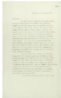
[Correspondence re recent incidents (see pp. 381-385)] Page 1-3 (2021_07_320)