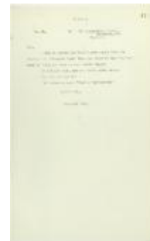
Copy of letter, unsigned, to the Immigration Agent (2021_07_10732)