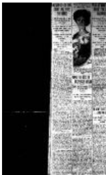
Newscipping - Vancouver Daily Province: No sign so far that court will free the Hindus (2021_07_5150)