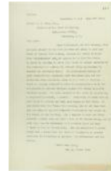
Copy of letter from J. E. Bird to Reid, criticising conduct of Board of Enquiry (2021_07_10692)