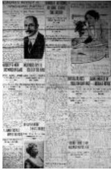
Newsclipping - Vancouver Daily Province: Hindus refusing to come ashore for enquiry. Page 1 (2021_07_10480)