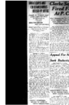
Newsclipping - Vancouver Sun: Habeas Corpus writ for detained Hindu refused by Justice. Page 1 (2021_07_10505)