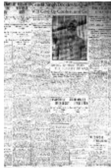
Newsclipping - Vancouver Daily Province: Gurdit Singh decides to quit: will give up contest and go (2021_07_10494)