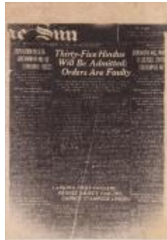
Newsclipping - Vancouver Sun: Thirty-five Hindus will be admitted: orders are faulty (2021_07_10527)