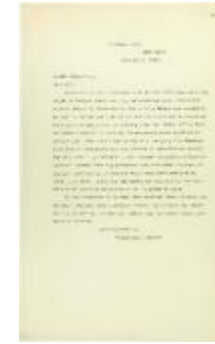
[Copy of letters enclosed with pp. 409-411 - letter from Reid to W. D. Scott re activities of J. E. Bird] (2021_07_604)