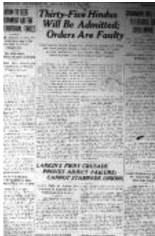
Newsclipping - Vancouver Sun: Thirty-five Hindus will be admitted: orders are faulty. Page 1 (2021_07_10506)