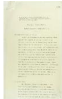
Minutes of a Hindu mass meeting held in Dominion Hall. Page 1-21 (2021_07_9506)