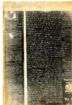
Newsclipping - Vancouver Sun: [re Komagata Maru] (2021_07_10439)