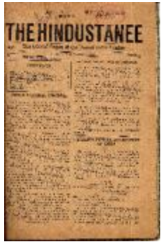
The Hindustanee. Vol. 1, no. II (2021_07_2023)