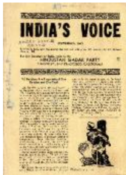
India's Voice (2021_07_2005)