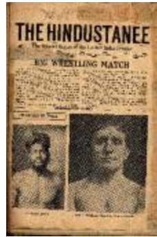
The Hindustanee. Vol. 1, no. IV (2021_07_2034)