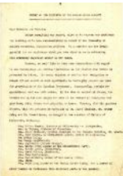
Report of the delegates of the Khalsa Diwan Society (2021_07_1987)