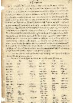
[Komagata Maru passenger list] (2021_07_1885)