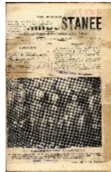
The Hindustanee. Vol. 1, no. IV (2021_07_2047)