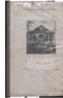
Khalsa Diwan Society [Diary], Vancouver, B.C. (2021_07_8876)