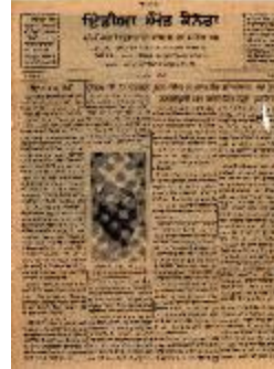
Punjabi edition of India and Canada monthly (2021_07_1907)