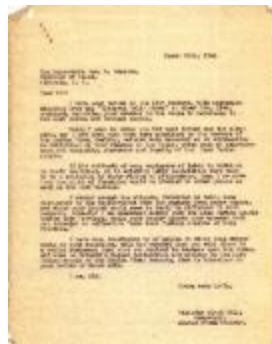
[Right to vote correspondence] (2021_07_1964)