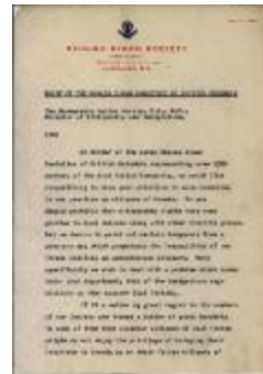
Brief of the Khalsa Diwan Societies of British Columbia (2021_07_5985)