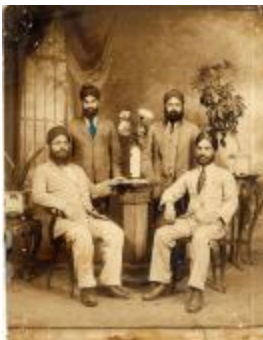
[Family portrait of four men] (2021_07_10288)