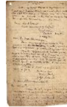
Letters of sympathy sent by different English and Indian friends expressing their sentiments about the meeting at Caxton