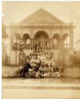
[Group of families on the steps of 2nd Avenue Temple, Vancouver] (2021_07_10285)