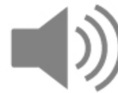
[Jawaharlal Nehru, India's first Prime Minister, speaks at Khalsa Diwan Society, Vancouver] (2021_07_10915)