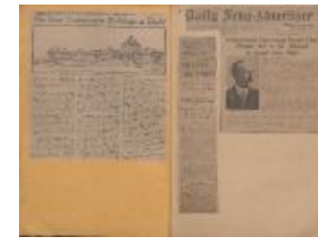
[1914 scrapbook] (2021_07_2291)