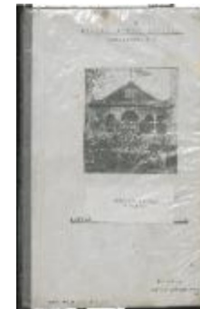
Khalsa Diwan Society [Diary], Vancouver, B.C. [ Volume 1 - English translation] (2021_07_10918)