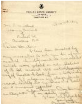
[Right to vote correspondence] (2021_07_1943)