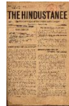
The Hindustanee. Vol. 1, no. 1 (2021_07_2014)