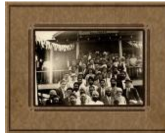
[Group on the steps of Hillcrest Sikh Temple] (2021_07_10286)