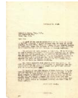
[Right to vote and Indian independence correspondence] (2021_07_1979)