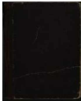
[Diary : United India Home Rule League of Canada and the Hindustani Swaraj Sabha] (2021_07_5956)