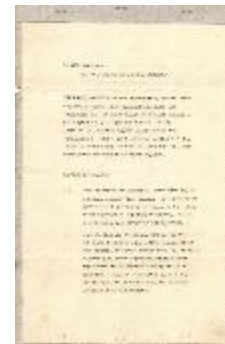
[Petition of the Khalsa Diwan Society of B.C. for Voting Franchise] (2021_07_1996)