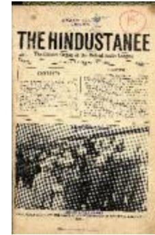
The Hindustanee. Vol. 1, no. V (2021_07_2069)