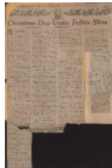
[1914 scrapbook] (2021_07_2227)