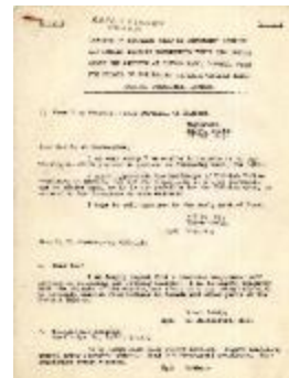
Letters of sympathy sent by different English and Indian friends expressing their sentiments about the meeting at Caxton