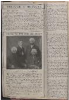
[Komagata Maru scrapbook] (2021_07_2181)