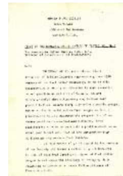
Brief of the Khalsa Diwan Societies of British Columbia [addressed to The Honourable Walter Harris, P.C., M.P.,