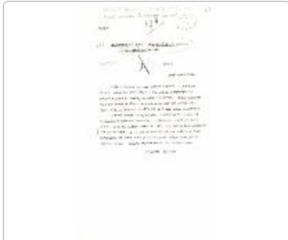
Paraphrase of cypher telegram from Mr. Harcourt to the Governor General [Lewis Harcourt, Secretary of State for the