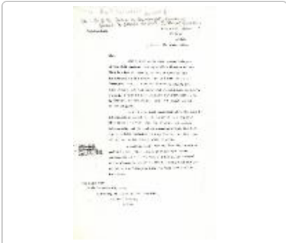
[Governor General, H. R. H. Prince Arthur, Duke of Connaught, to Lewis Harcourt, Secretary of State for the Colonies]