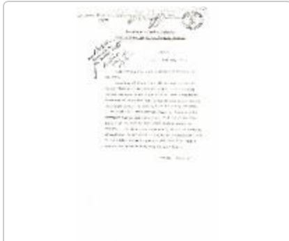
[Andrew Bonar Law, Colonial Secretary, to Governor General, Prince Arthur, Duke of Connaught, London, re how to deal with