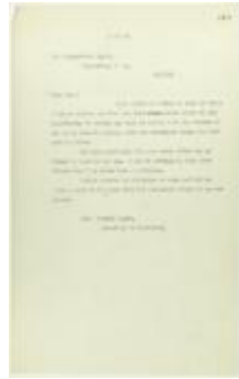
Copy of letter from Daljit Singh to the Immigration Agent (2021_07_10705)