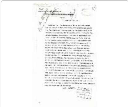
[Lewis Harcourt, Secretary of State for the Colonies, to Governor General, H. R. H. Prince Arthur, Duke of Connaught, re