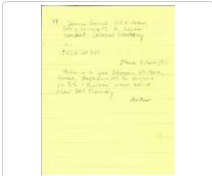
[Governor General, H. R. H. Prince Arthur, Duke of Connaught, to Lewis Harcourt, Secretary of State for the Colonies, re