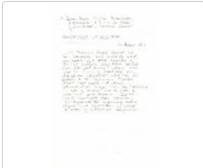
[James Bryce, British Ambassador, Washington, to Governor General, H. R. H. Prince Arthur, Duke of Connaught,