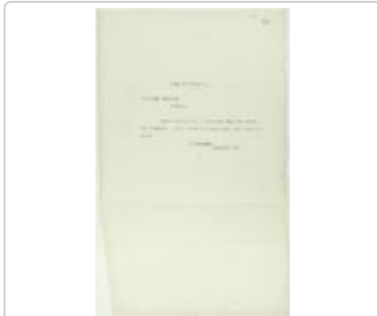
Copy of telegram, signed Passengers, sent to Governor General re shortage of water (2021_07_10703)