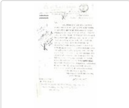
[Lewis Harcourt, Secretary of State for the Colonies, to Governor General, H. R. H. Prince Arthur, Duke of Connaught, London,