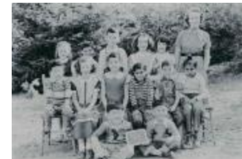
[Group photo of the class of 1955 at Mayo School, Paldi, B. C.] (2023_09_01_01_03_020)