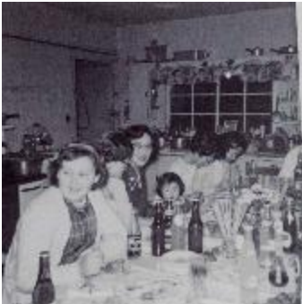
[Photo of a group of women and a child sitting at a dining table] (2023_09_01_01_03_001)