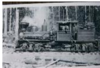
[Photo of a wood burner locomotive deployed at Mayo Lumber Company, Paldi, B.C.] (2023_09_01_02_02_008)