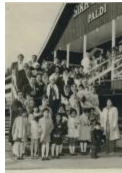
[Photo of a group of people standing on the staircase of Paldi Gurdwara] (2023_09_01_01_12_040)