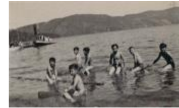
[Photo of a group of children at Maple Bay, B.C.] (2023_09_01_01_03_024)