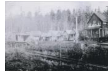
[Photo of Mayo Lumber Company office and store, Paldi, B.C.] (2023_09_01_02_01_001)