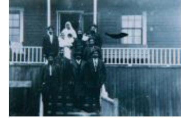
[Photo of a group of people standing outside Paldi Gurdwara] (2023_09_01_01_12_008)