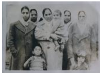
[Photo of a group of unidentified women and children] (2023_09_01_01_12_022)