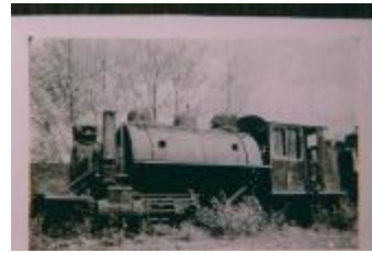
[Photo of a steam locomotive deployed by Mayo Lumber Company] (2023_09_01_02_02_020)