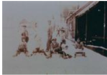
[Photo of a group of children playing in the snow on the boardwalk, Paldi, B.C.] (2023_09_01_01_12_010)