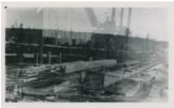
[Composite photo of two different scenes at Mayo Lumber Company, Paldi, B.C.] (2023_09_01_02_02_006)