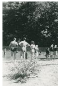
[Photo of a group of people on the bank of a river] (2023_09_01_01_12_027)