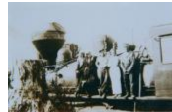
[Photo of a group of unidentified individuals standing on the steam engine] (2023_09_01_02_02_009)