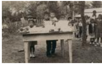
[Photo of Doris Vic and Dick Yano standing behind a table] (2023_09_01_01_03_015)