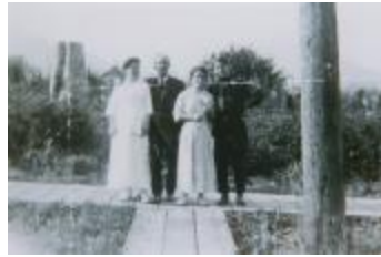
[Photo of a group of people standing on the boardwalk, Paldi, B.C.] (2023_09_01_01_12_018)