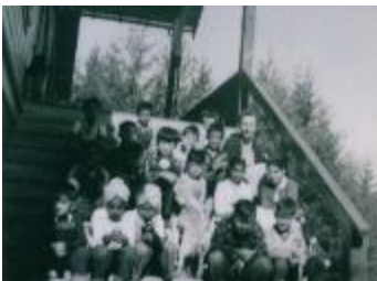
[Photo of a group of students and teacher at Paldi School, B.C.] (2023_09_01_01_12_025)