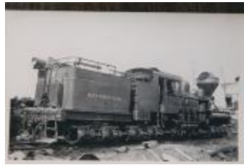
[Photo of the 3-spot steam engine at Mayo Lumber Company] (2023_09_01_02_02_003)