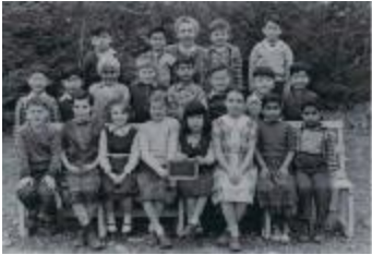
[Group photo of the class of 1956 at Mayo School, Paldi, B. C.] (2023_09_01_01_03_021)