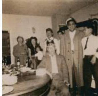
[Photo of a group of people gathered around a dining table] (2023_09_01_01_03_010)