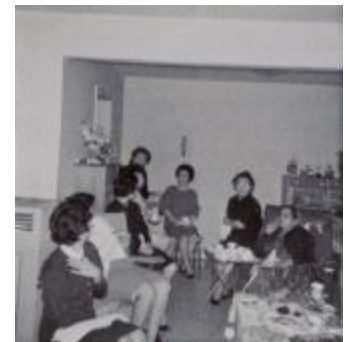
[Photo of a group of women sitting inside a house] (2023_09_01_01_03_006)