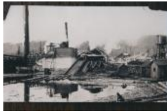
[Photo of Mayo Lumber Mill and the mill pond] (2023_09_01_02_01_007)