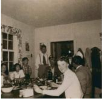
[Photo of a group of people at a dining table] (2023_09_01_01_03_009)