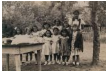
[Photo of a group of children standing under a tree] (2023_09_01_01_03_014)