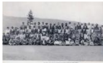
[Photo of a group of sawmill workers, Paldi, B.C.] (2023_09_01_01_12_023)