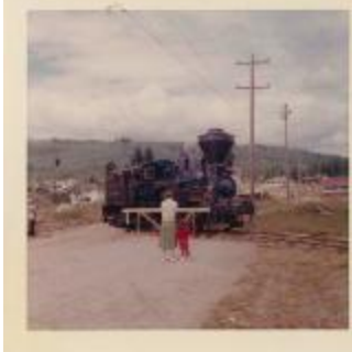
[Photo of a steam engine crossing a street in Paldi, B. C.] (2023_09_01_01_08_004)