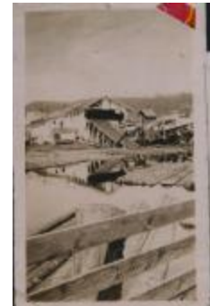
[Photo of Mayo Lumber Mill and the mill pond] (2023_09_01_02_01_009)