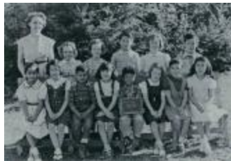
[Group photo of the class of 1954 at Mayo School, Paldi, B. C.] (2023_09_01_01_03_019)