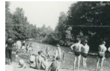
[Photo of a group of people on the bank of a river] (2023_09_01_01_12_016)