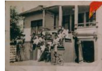
[Photo of Rajindi Mayo with a group of children outside Mayo Singh's house in Paldi] (2023_09_01_01_12_033)