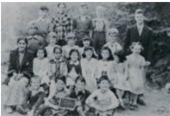
[Group photo of the class of 1952 at Mayo School, Paldi, B. C.] (2023_09_01_01_03_017)