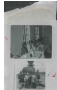
[Collage of two photos] (2023_09_01_01_12_037)