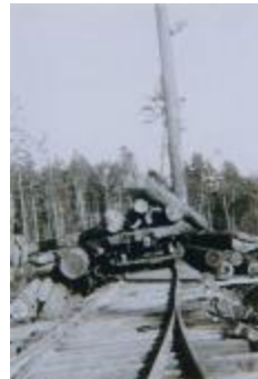
[Photo of a flat car being loaded with logs] (2023_09_01_02_02_019)