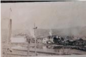
[Photo of Mayo Lumber Mill and the mill pond] (2023_09_01_02_02_002)