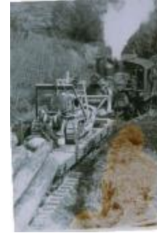
[Photo of a steam engine transporting logs and heavy duty equipment] (2023_09_01_02_02_017)