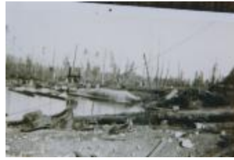
[Photo of the mill pond being used as a log dump, Paldi, B.C.] (2023_09_01_02_01_004)