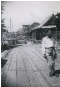
[Photo of a boy standing on the boardwalk, Paldi, B.C.] (2023_09_01_01_12_009)