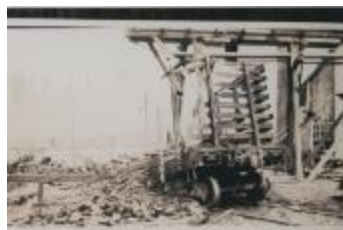
[Photo of a heavy-duty equipment at Mayo Lumber Mill, Paldi, B.C.] (2023_09_01_02_02_011)