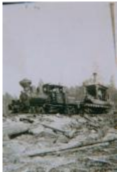
[Photo of a steam engine transporting a steam donkey] (2023_09_01_02_02_018)