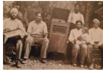
[Photo of a group of men with music instruments] (2023_09_01_01_11_003)