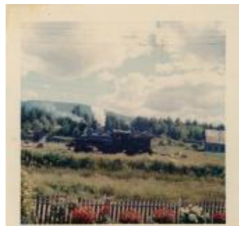
[Photo of a steam engine running on the tracks] (2023_09_01_01_08_009)