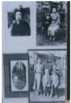
[Collage of four photos] (2023_09_01_01_12_013)