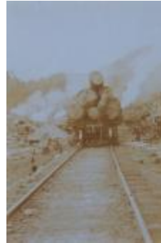
[Photo of a load of logs mounted on a steam car] (2023_09_01_02_02_016)