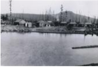
[Photo of the mill pond with houses in the background, Paldi, B.C.] (2023_09_01_02_01_002)