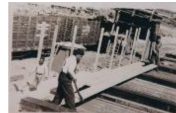
[Photo of two Sikh men on the timber deck at Mayo Lumber Mill in Paldi, B.C.] (2023_09_01_02_02_001)