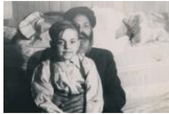
[Photo of a man holding a child] (2023_09_01_01_09_002)