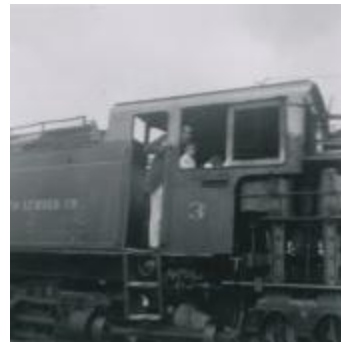
[Photo of Rajindi Mayo with a child on a steam engine] (2023_09_01_01_08_002)