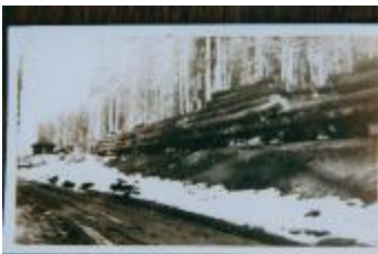
[Photo of a load of timber being transported through the steam engine and cars] (2023_09_01_02_02_010)