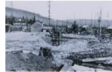
[Photo of the creation of mill pond, Paldi, B.C.] (2023_09_01_02_01_005)