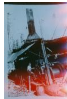
[Photo of Cossy Asanda operating the steam donkey] (2023_09_01_02_02_013)