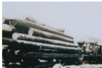
[Photo of the first logging train delivering a load to the mill in Paldi, B.C.] (2023_09_01_02_02_007)