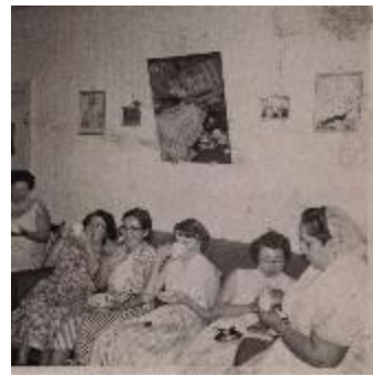
[Photo of a group of women sitting on a sofa] (2023_09_01_01_03_007)