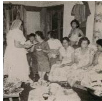
[Photo of a group of women in a living room] (2023_09_01_01_03_002)