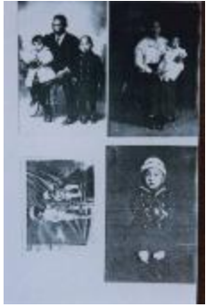
[Collage of four photos] (2023_09_01_01_12_017)