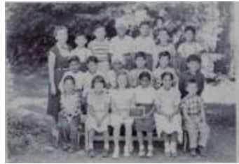
[Group photo of the class of 1957 at Mayo School, Paldi, B. C.] (2023_09_01_01_03_022)