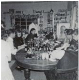
[Photo of a group of men and women sitting at a dining table] (2023_09_01_01_03_005)