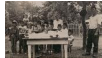
[Photo of a group of children standing behind a table] (2023_09_01_01_03_016)