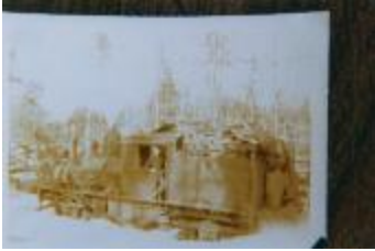
[Photo of an unidentified man standing on the steam locomotive] (2023_09_01_02_02_014)