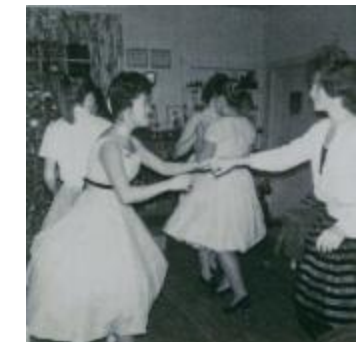
[Photo of a group of women dancing in pairs inside a house] (2023_09_01_01_03_008)