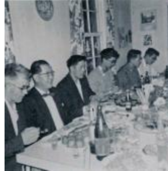
[Photo of a group of men sitting at a dining table] (2023_09_01_01_03_011)