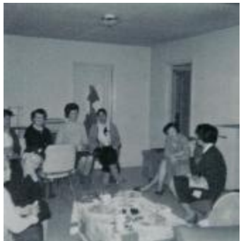
[Photo of a group of women sitting inside a house] (2023_09_01_01_03_025)