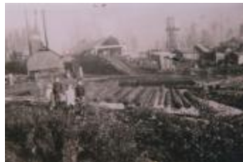
[Photo of a group of unidentified children standing near the mill pond] (2023_09_01_02_01_011)