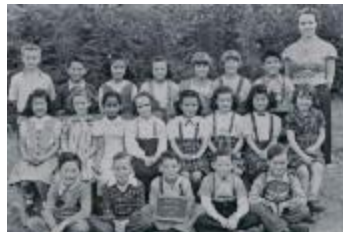
[Group photo of the class of 1953 at Mayo School, Paldi, B. C.] (2023_09_01_01_03_018)