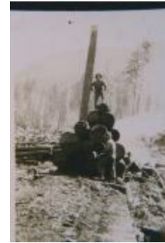
[Photo of an unidentified man standing on a stack of logs in Duncan, B.C.] (2023_09_01_02_02_005)