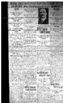
Newsclipping - Vancouver Daily Province: Gurdit Singh won't pay up: what will Komagata do now? Page 1