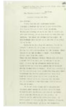
Copy of address to the Secretary of the Sikh Temple, Vancouver, unsigned. Page 1-6 (2021_07_1216)