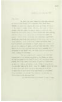
[Correspondence re recent incidents (see pp. 381-385)] Page 1-3 (2021_07_320)