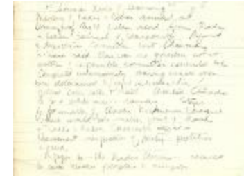
Newsclipping - Vancouver News-Advertiser: Sounds note of warning (2021_07_10394)