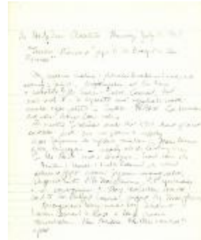
Newsclipping - Vancouver News-Advertiser: Twelve thousand Japs to be brought to this province (2021_07_10389)