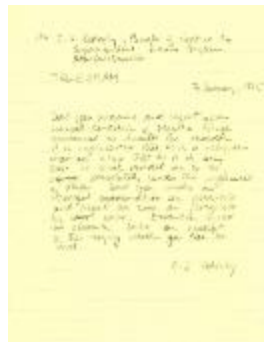
[Charles J. Doherty, Minister of Justice, to Superintendent, Insane Asylum, New Westminster, re mental condition of Mewa]