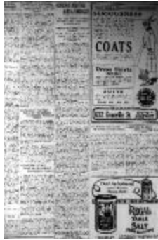
Newsclipping - Vancouver Sun: Verdict of acquittal in Bela Singh case. Page 2 (2021_07_10462)