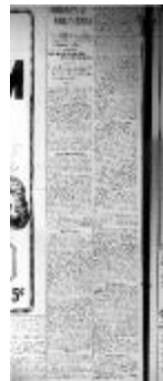
Newsclipping - Vancouver News-Advertiser: Seditious at work in temple (2021_07_10458)