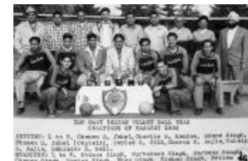
[Group photo of the Youbou Rockets at Champions of Vaisakhi 1956, Youbou, B.C.] (2023_06_01_025)