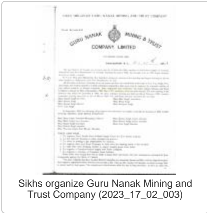
Sikhs organize Guru Nanak Mining and Trust Company (2023_17_02_003)