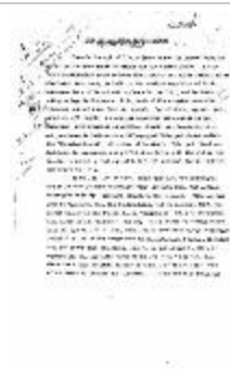
Note on the Hindu Revolutionary Movement in Canada (2021_07_5232)