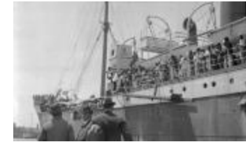
S. S. 'Komagata Maru' [and Canadian officials] (2021_07_10614)