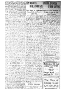
Newsclipping - Vancouver Daily Province: Jury disagrees in Bela Singh case. Page 24 (2021_07_10460)