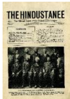
The Hindustanee: The Official Organ of the United India League. Volume 1, Number 3 (2021_07_10923)