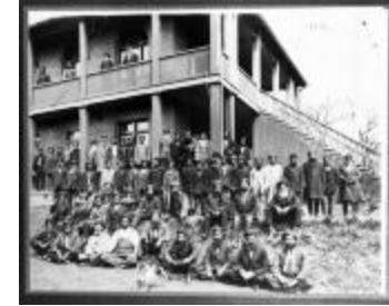
[Group photo in front of Old Gurdwara, Victoria] (2021_07_10263)