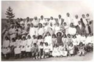
[Wives and children of Mayo Lumber workers] (2021_07_10260)