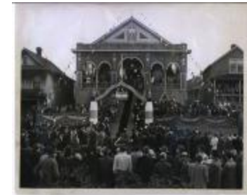
[Jawaharlal Nehru visit to 2nd Avenue Temple, 1949] (2021_07_10540)