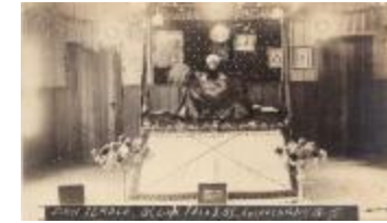
Sikh Temple, Ocean Falls B.C. Sunday 6th July [photo postcard] (2021_07_1504)