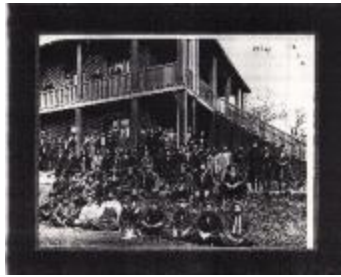
[Group photo in front of Old Gurdwara, Victoria, with names inscribed] (2021_07_1498)