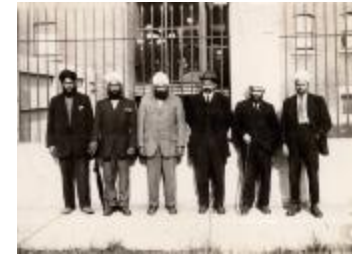
[Men in front of immigration detention centre, Victoria] (2021_07_10279)