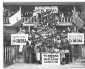
[Group in front of New Westminster Temple celebrating Indian independence] (2021_07_10272)