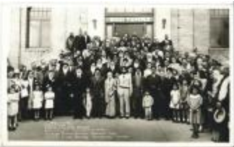
Welcome to Vijaya Lakshmi Pandit (Indian National Leader, Sister of Nehru). Khalsa Diwan Society, Stockton, Calif. Khalsa Diwan Society, Vancouver, Canada. (2021_07_10264)