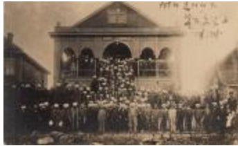
[2nd Avenue Temple, Vancouver] (2021_07_1510)