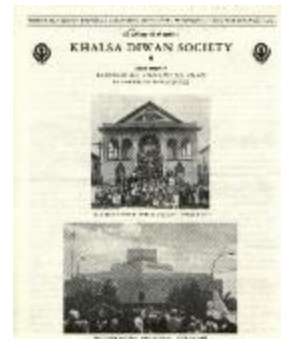
Khalsa Diwan Society [pamphlet] (2021_07_1518)