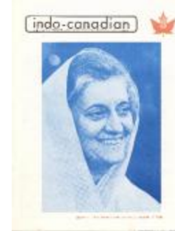
Indo-Canadian: A bi-monthly magazine - serving East Indian community of British Columbia, Canada (2021_07_1531)