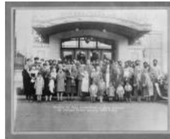
Welcome to Revd. C. F. Andrews at G. N. R. Station by Khalsa Diwan Society, April 5, 1929 (2021_07_10282)