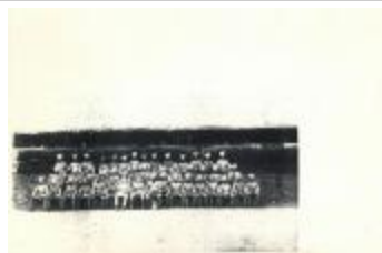
[Sikh regiment in B.C. after Queen Victoria's Jubilee] (2021_07_10281)