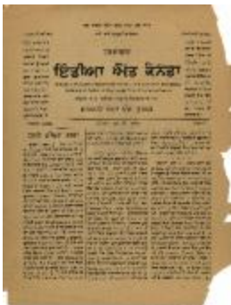
Weekly Punjabi edition of India and Canada monthly (2021_07_1545)