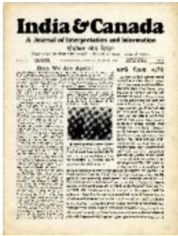
India & Canada: A Journal of Interpretation and Information. Vol. II, no. 1 (2021_07_1037)