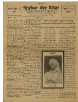
Fortnightly Punjabi edition of India and Canada (2021_07_1550)