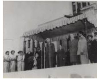
[Jawaharlal Nehru speaking on stage in Canada] (2021_07_10262)