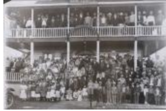
[Large group on temple steps] (2021_07_10276)