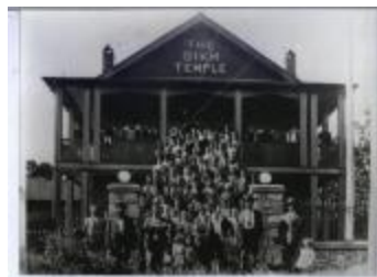
[Men, women and children in front of Hillcrest Temple] (2021_07_10542)