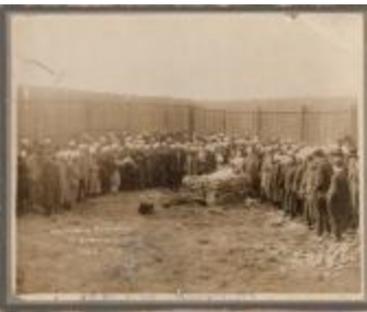
Cremating remains of Hasnam Koor (2021_07_10270)