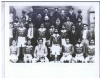
[India Hockey Club in front of Vancouver Sikh Temple at 1866 West 2nd Avenue] (2021_07_10541)