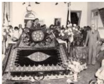
[Jawaharlal Nehru speaking in 2nd Avenue Temple, Vancouver] (2021_07_10271)