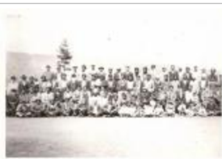
[Mayo Lumber workers] (2021_07_10261)