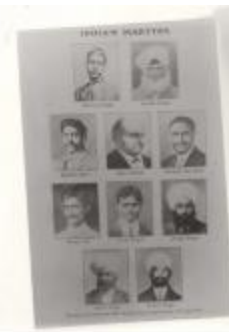
India's Martyrs (2021_07_10267)