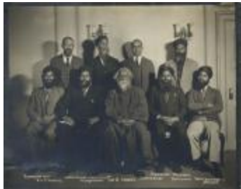
[Khalsa Diwan organizers] (2021_07_10280)