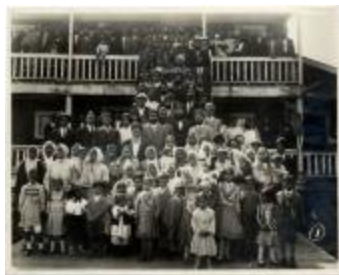
[Group on temple steps] (2021_07_10265)