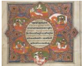
Dasam Granth (2021_05_034)