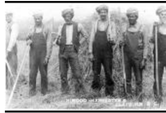
[Sikh] harvesters (2021_05_016)