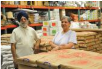
Couple business (2021_05_083)