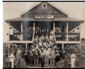
Hillcrest Gurdwara (2021_05_035)