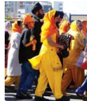
Woman walking (2021_05_102)