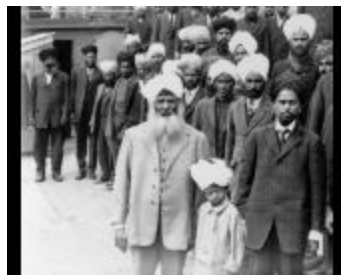
Sikh men and boy onboard the Komagata Maru (2021_05_040)