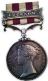
Lucknow medal (2021_05_010)