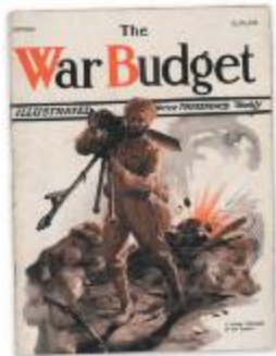
The War Budget Illustrated cover (2021_05_059)