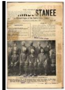
The Hindustanee : the official organ of the United India League (2021_05_029)