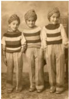
Banga boys (2021_05_032)