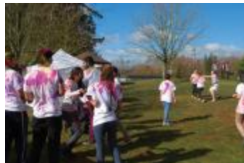
Holy colour (2021_05_088)