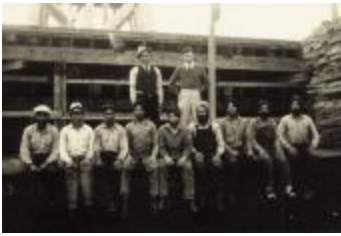
[Lumber mill workers] (2021_05_014)