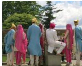
Wedding party (2021_05_101)