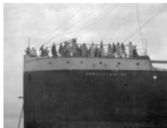
The S.S. Komagata Maru with passengers on decks (2021_05_064)