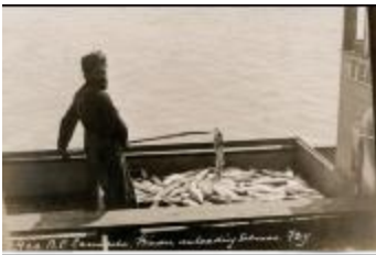
Imperial Cannery - unloading fish (2021_05_018)