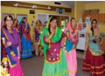
UFV dancing (2021_05_095)