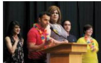
LGBTQ celebrations (2021_05_089)