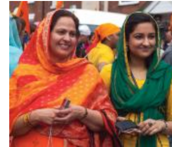
Two women (2021_05_094)