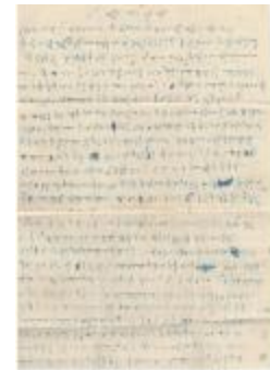
[Kartar Kaur correspondence] (2021_05_078)