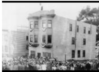
Ghadar headquarters (2021_05_068)