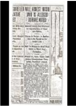
Will arrest [South Asian Canadian] who is alleged to have voted (2021_05_026)