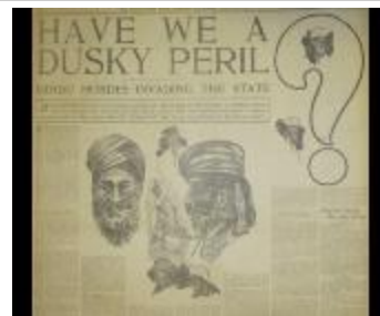
Have we a dusky peril? : [South Asian immigrants] invading the state (2021_05_011)