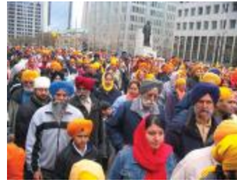
Sikh on the move (2021_05_093)