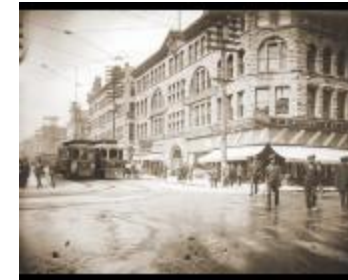
[Street corner] (2021_05_013)