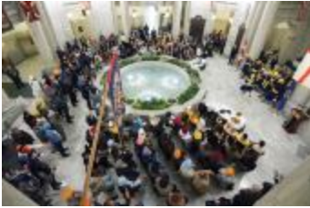
Alberta assembly (2021_05_079)