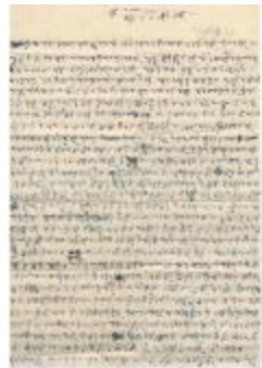
[Kartar Kaur correspondence] (2021_05_076)