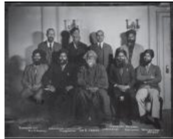
[Khalsa Diwan organizers] (2021_05_048)