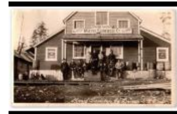
[Mayo Lumber Co. store] (2021_05_050)