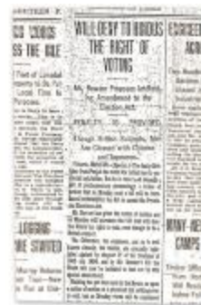
Will deny [South Asian Canadians] the right of voting (2021_05_024)