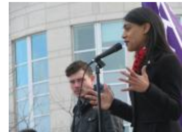
Minister Bardish Chagger (2021_05_090)