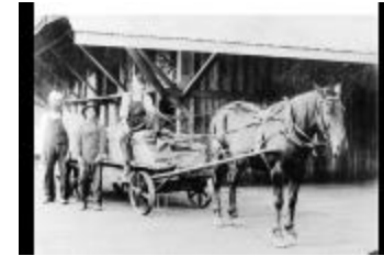
Horse and cart (2021_05_017)