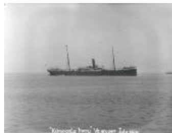
Komagata Maru incident (2021_05_065)