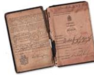
[Indar Singh's passport] (2021_05_003)