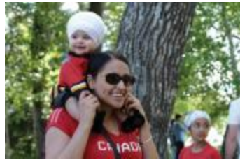
Cutie pie (2021_05_084)