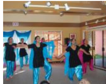
UFV more dancing (2021_05_097)