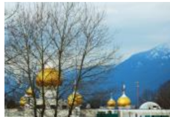
Van temple blue (2021_05_100)