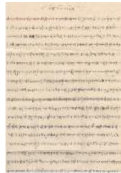
[Kartar Kaur correspondence] (2021_05_077)