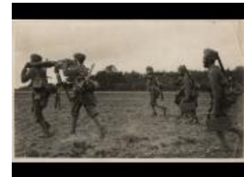
WW1 sikh soldiers (2021_05_054)