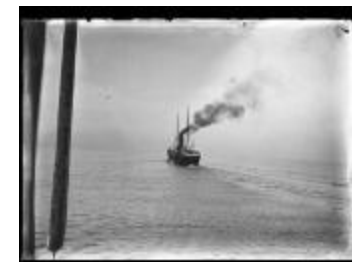
Komagata leaving Vancouver (2021_05_066)