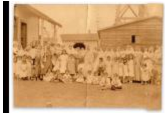
[Paldi women] (2021_05_049)