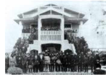
Sikh Temple Stockton (U.S.A.) 1912 : one of the centres of Gadar activities (2021_05_070)