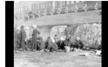
[Photo of new immigrants of South Asian origin near the Canadian Pacific Railway wharf in Victoria, BC] (2021_05_021)