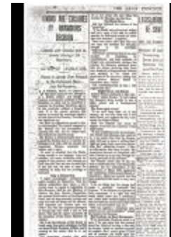
[South Asian Canadians] are excluded by unanimous decision (2021_05_025)