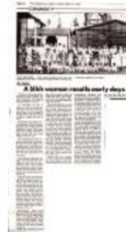
At Paldi : a sikh woman recalls early days (2021_05_053)