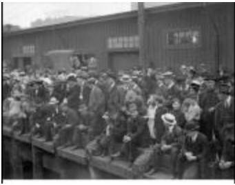
[Onlookers on wharf watching the "Komagata Maru"] (2021_05_067)