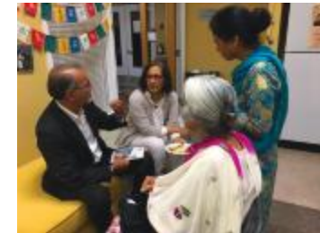
UFV Shauna launch (2021_05_098)