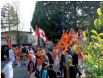
Vaisakhi flag (2021_05_099)