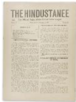
The Hindustanee : the official organ of the United India League (2021_05_027)