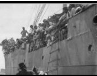
Komagata Maru ship side (2021_05_063)