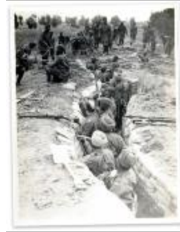
Sikhs in WWI trenches (2021_05_062)