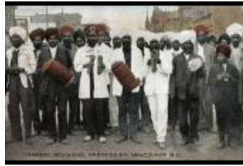
Sikh religious procession Vancouver BC (2021_05_015)