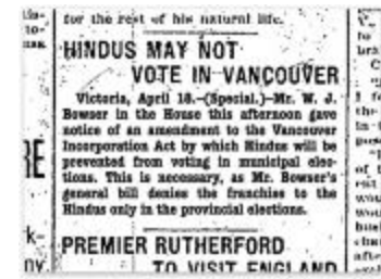
[South Asian Canadians] may not vote in Vancouver (2021_05_031)