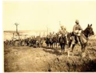
Sikh cavalry (2021_05_057)