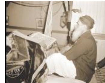
Worshipping inside the Khalsa Diwan Society sikh temple (2021_05_037)