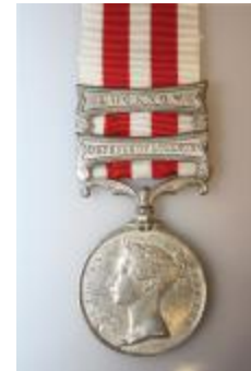
Defence of Lucknow medal (2021_05_009)