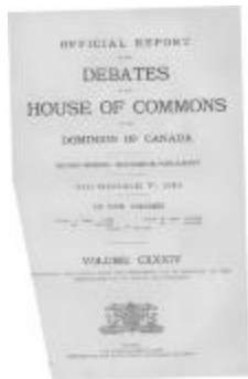
Official report of the debates of the House of Commons of the Dominion of Canada : second session thirteenth parliament ;