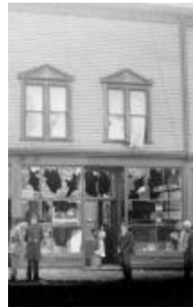
Chinatown riots (2021_05_019)