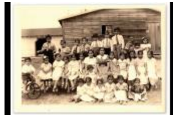
[School children] (2021_05_052)