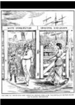
The same act which excludes [Asian immigrants] should open wide the portals of British Columbia to white immigration