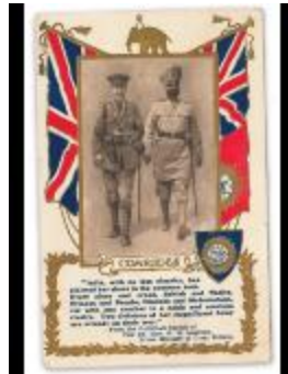
Imperial propaganda (2021_05_060)