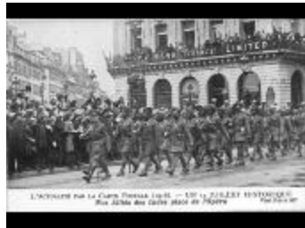
Sikhs in Paris (2021_05_056)