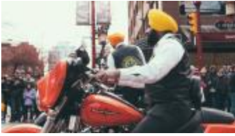
Motorcycle club (2021_05_091)