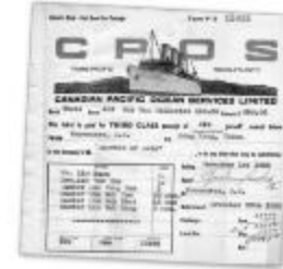
[Lim family ticket for the Empress of Asia] (2021_05_004)