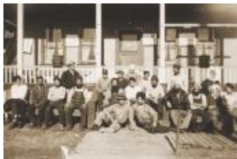
Paldi lumber yard (2021_05_051)