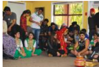
UFV holy sitting (2021_05_096)