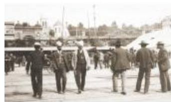
Market life, Friday (2021_05_006)