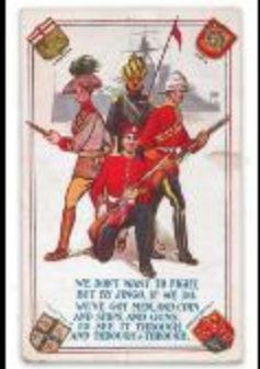
Imperial propaganda (2021_05_061)