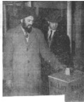
New Canadian makes voting history 1947, placing the vote in the ballot box (2021_05_002)