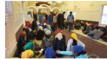
Gur Sikh Temple tour (2021_05_086)