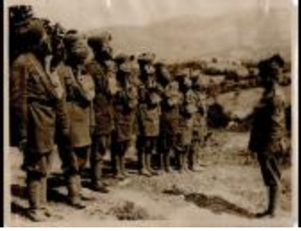
Sikhs with gas masks WW2 (2021_05_055)