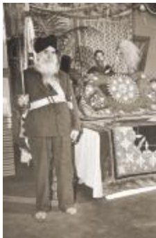
[The shrine in the Sikh Temple at 1866 West 2nd Avenue] (2021_05_038)