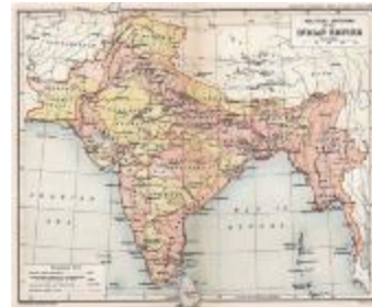
Political divisions of the Indian empire (2021_05_012)