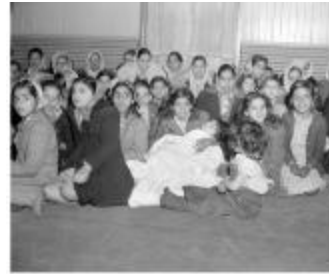
[Women and children inside the Khalsa Diwan Society] Sikh Temple (2021_05_045)