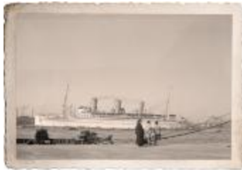
Empress of Japan (2021_05_005)