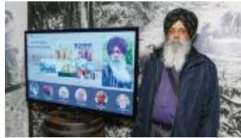
[Indo Canadian Intercultural History at the Royal BC Museum] (2021_05_080)