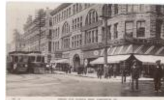
Where the nations meet (2021_05_007)