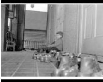
[Boy taking off shoes outside the Khalsa Diwan Society] Sikh Temple (2021_05_047)