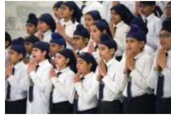
[Children's choir] (2021_05_081)