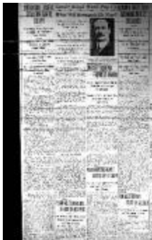
Newsclipping - Vancouver Daily Province: Gurdit Singh won't pay up: what will Komagata do now? Page 1