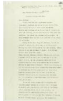
Copy of address to the Secretary of the Sikh Temple, Vancouver, unsigned. Page 1-6 (2021_07_1216)