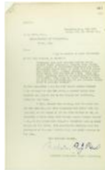
Copy of letter from Reid to W. D. Scott re provision of water (2021_07_10709)