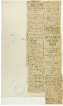
Newsclippings - Vancouver Daily Province: Full instructions coming tomorrow; Against alien labor; Sang the doxology when license