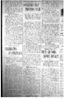
Newsclipping - Vancouver News-Advertiser: Consignees may provision Maru. Page 1 (2021_07_10501)