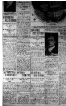
Newsclipping - Vancouver Daily Province: Local Hindus offer the money. Page 1 (2021_07_10483)