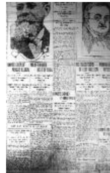
Newsclipping - Vancouver Daily Province: Lawyers engaged in Hindu tangle. Page 1 (2021_07_10484)