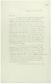
[Correspondence re recent incidents (see pp. 381-385)] Page 1-3 (2021_07_320)