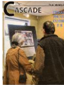
[Newspaper clipping titled, Centre for Indo-Canadian Studies hosts Udaari exhibit] (2022_01_01_06_015)