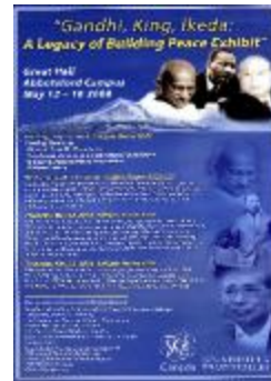
Gandhi, King, Ikeda: a legacy of building peace exhibit [poster] (2022_01_01_06_003)