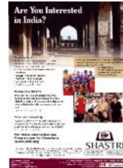
Are you interested in India? [poster] (2022_01_01_06_004)