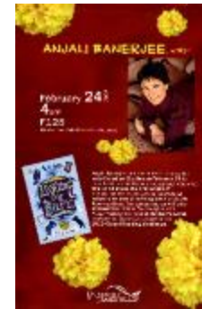
[Poster for Anjali Banerjee reading] (2022_01_01_06_040)