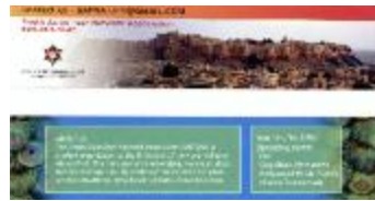
South Asian Peer Network Association [contact card] (2022_01_01_06_038)