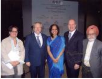
[Group photo from the transnational Punjabis in the 21st century conference] (2022_01_01_06_049)