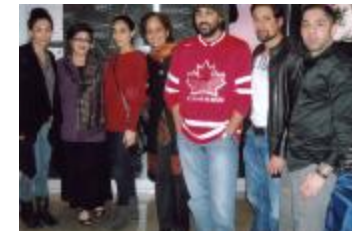
[Photograph taken at film screening] (2022_01_01_06_048)