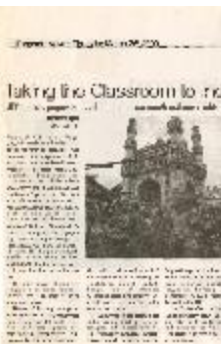
[Newspaper clipping titled, Taking the classroom to India] (2022_01_01_06_036)