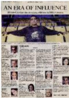
[Newspaper clipping titled, An era of influence: 100 Indo-Canadians who are making a difference in British Columbia]