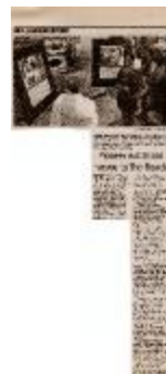
[Newspaper clipping titled, Indo-Canadian History] (2022_01_01_06_022)