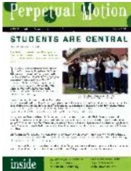
[Newsletter clipping titled, Students are central] (2022_01_01_06_029)