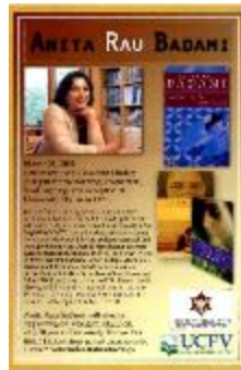
Anita Rau Badami [poster] (2022_01_01_06_006)