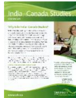
India-Canada studies certificate [poster] (2022_01_01_06_019)