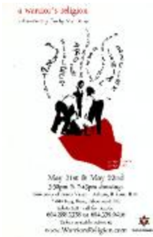
[Poster for screening of "a warrior's religion" - a documentary film by Mani Amar] (2022_01_01_06_039)