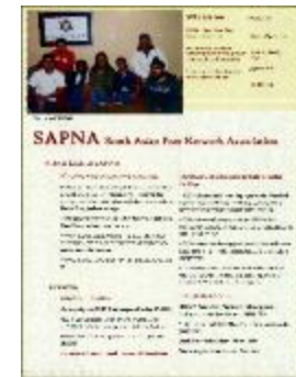
[Brochure for South Asian Peer Network Association] (2022_01_01_06_020)