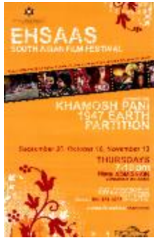
Ehsaas South Asian Film Festival [poster] (2022_01_01_06_013)