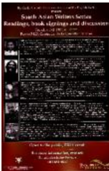
South Asian writers series readings, book signings and discussions [poster] (2022_01_01_06_033)