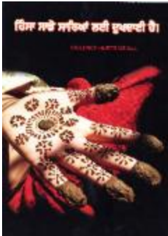
Violence hurts us all, save our daughters, stop violence against women today [poster] (2022_01_01_06_005)