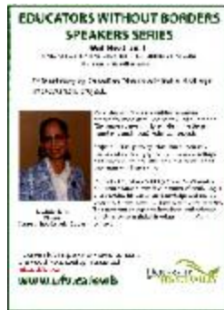
Educators without borders speakers series [poster] (2022_01_01_06_046)