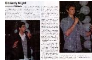
[Newspaper clipping and ticket] (2022_01_01_06_016)