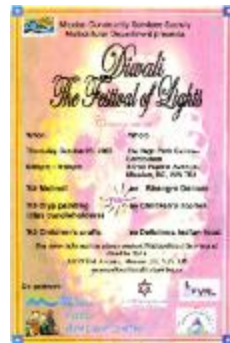
Diwali the festival of lights [poster] (2022_01_01_06_018)