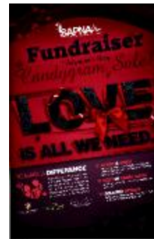
Valentine's day candygram sale [poster] (2022_01_01_06_032)