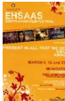
EHSAA South Asian film festival [poster] (2022_01_01_06_034)