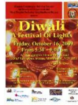
Diwali: a festival of lights [poster] (2022_01_01_06_044)