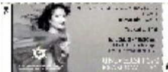
[Event ticket starring Kiran Ahluwalia] (2022_01_01_06_009)