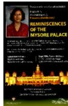
Reminiscences of the Mysore Palace [poster] (2022_01_01_06_043)