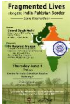
Fragmented lives along the India-Pakistan border: some observations [poster] (2022_01_01_06_041)