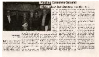
[Newspaper clipping titled, Finding common grounds] (2022_01_01_06_026)