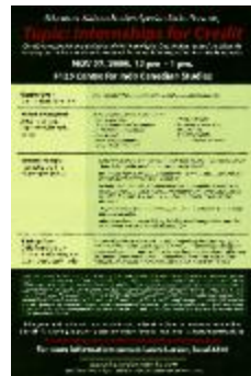
Topic: internships for credit [poster] (2022_01_01_06_021)