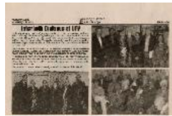
[Newspaper clipping titled, Interfaith dialogue at UFV] (2022_01_01_06_031)