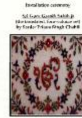
Installation ceremony [notice] (2022_01_01_06_051)