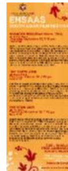
Ehsaas South Asian film festival [poster] (2022_01_01_06_011)