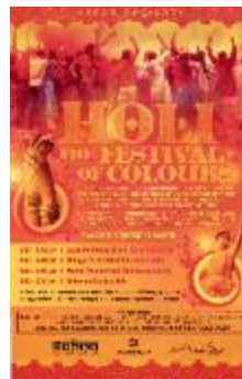
Holi: the festival of colours [poster] (2022_01_01_06_035)