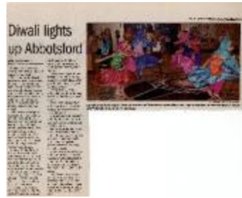
[Newspaper clipping titled, Diwali lights up Abbotsford] (2022_01_01_06_050)