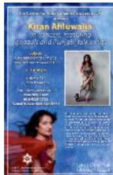
The Centre for Indo-Canadian Studies at UFV presents Kiran Ahluwalia in concert, featuring ghazals and Punjabi folk songs