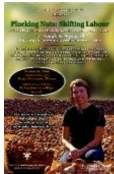
Plucking nuts: shifting labour [poster] (2022_01_01_06_045)