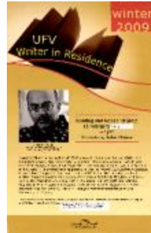
UFV writer in residence [poster] (2022_01_01_06_027)