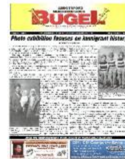
[Newspaper clipping titled, Photo exhibition focuses on immigrant history] (2022_01_01_06_012)