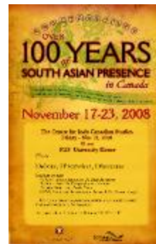
Commemorating over 100 years of South Asian presence in Canada [poster] (2022_01_01_06_023)