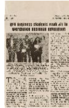
[Newspaper clipping titled, UFV business students rank #1 in worldwide business simulation] (2022_01_01_06_028)