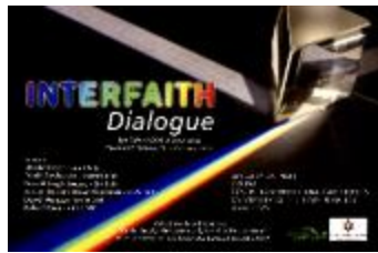
Interfaith dialogue [poster] (2022_01_01_06_030)