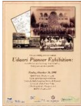
[Invitation to Udaari pioneer exhibition] (2022_01_01_06_014)