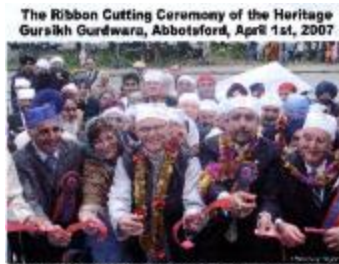
[Newspaper clipping titled, The ribbon cutting ceremony of the heritage Gursikh gurdwara, Abbotsford, April 1st, 2007] (2022_01_01_03_006)