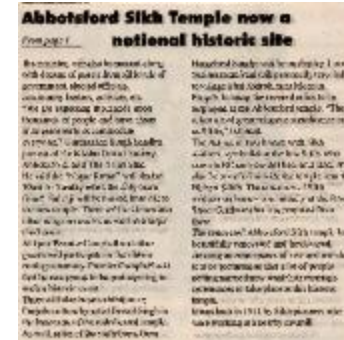
[Newspaper clipping titled, The Abbotsford Sikh temple to become a national historic site of Canada on Sunday]