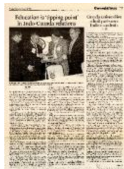
[Newspaper clipping of articles related to Indo-Canadian relations in the educational sector] (2022_01_01_03_015)