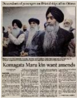
[Newspaper clipping titled, Descendants of passengers on ill-fated ship call on Ottawa, Komagata Maru kin want amends] (2022_01_01_03_002)