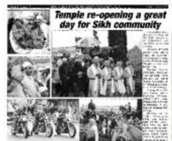
[Newspaper article titled, Temple re-opening a great day for Sikh community] (2022_01_01_03_023)