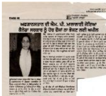
[Newspaper article titled, Aghanistan M.P. Malalai Joya appeals to the Canadian government to send no more troops] (2022_01_01_03_019)