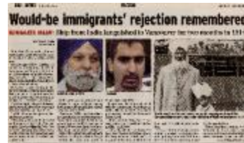
[Newspaper clipping titled, would-be immigrants' rejection remembered] (2022_01_01_03_010)