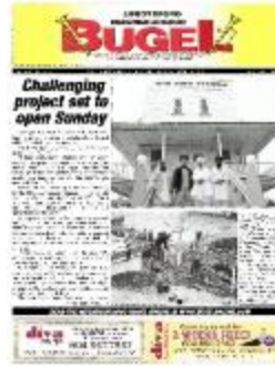
[Challenging project set to open Sunday] (2022_01_01_03_003)