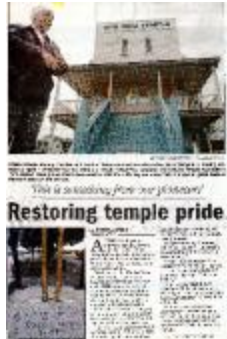
[Newspaper clipping titled, Restoring temple pride] (2022_01_01_03_005)