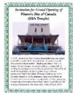
[Invitation for grand opening of historic site of Canada (Sikh temple)] (2022_01_01_03_020)