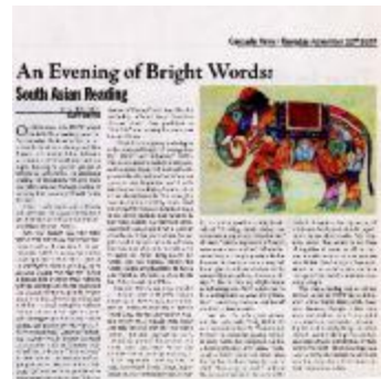
[Newspaper article titled, An evening of bright words: South Asian reading] (2022_01_01_03_018)