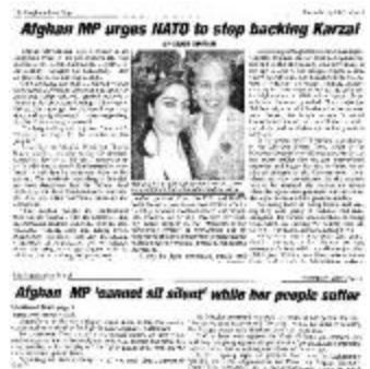
[Newspaper article titled, Afghan MP urges Nato to stop backing Karzai] (2022_01_01_03_017)