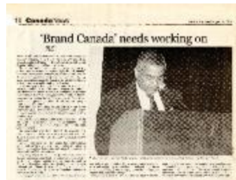
[Newspaper clipping titled, 'Brand Canada' needs working on] (2022_01_01_03_014)