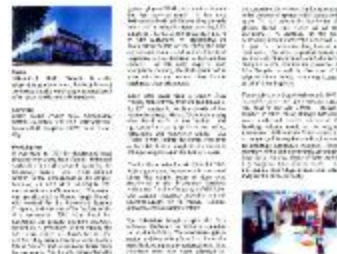
[Information brochure on the Abbotsford Sikh Temple] (2022_01_01_03_011)