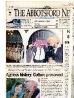
[Newspaper clipping titled, Ageless history: culture preserved] (2022_01_01_03_012)