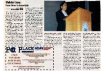
[Newspaper article titled, Malalai Joya: warrior woman for human rights] (2022_01_01_03_016)