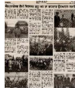
[Newspaper clipping on the Gur Sikh temple reopening ceremony] (2022_01_01_03_008)