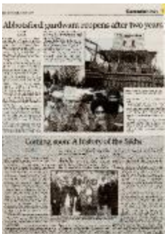
[Newspaper clipping titled, Abbotsford gurdwara reopens after two years] (2022_01_01_03_009)