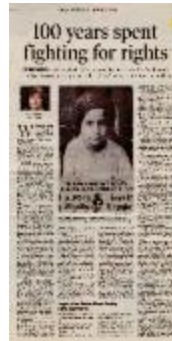
[Newspaper clipping titled, 100 years spent fighting for rights] (2022_01_01_03_002)