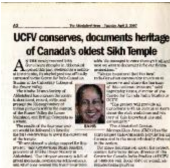
[Newspaper article titled, UCFV conserves, documents heritage of Canada's oldest Sikh temple] (2022_01_01_03_021)