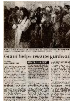
[Newspaper clipping titled, Grant helps restore gurdwara] (2022_01_01_03_007)