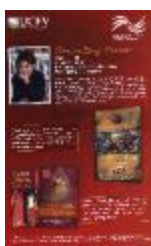
[Poster titled, Shauna Singh Baldwin public book reading and signing] (2022_01_01_01_008)