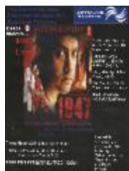
[Centre for Indo-Canadian Studies: Film screening of 1947 Earth] (2022_01_01_01_006)