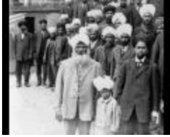
Sikh men and boy onboard the Komagata Maru (2021_05_040)