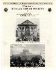
Khalsa Diwan Society (2020_04_004_036)