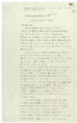
Copy of address to the Secretary of the Sikh Temple, Vancouver, unsigned. Page 1-6 (2021_07_1216)