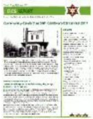
[CICS Report: community celebrates Sikh Gurdwara centennial 2011] (2022_01_01_01_077)