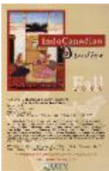
INCS 392 - immigration & social integration: the Indo-Canadian experience [poster] (2022_01_01_01_011)