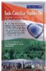
[Poster titled, Indo Canadian studies 396] (2022_01_01_01_049)