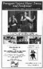
[Centre for Indo-Canadian Studies: banquet/ talent show/dance and fundraiser] (2022_01_01_01_004)