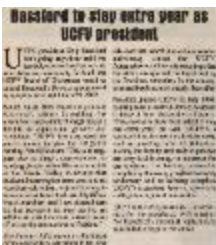
[Newspaper clipping titled, Bassford to stay extra year as UCFV president] (2022_01_01_01_028)