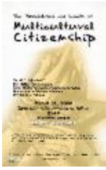
The possibilities and limits of multicultural citizenship [poster] (2022_01_01_01_007)