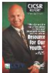
Center for Indo-Canadian Studies and Research report: a partnership for youth [Report] (2022_01_01_01_056)