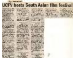
[Newspaper clipping titled, UCFV hosts South Asian film festival] (2022_01_01_01_021)