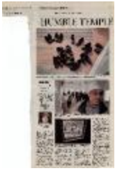
[Newspaper clipping tilted, Humble temple proud heritage] (2022_01_01_01_039)