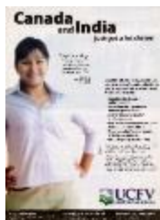
[Poster titled, Canada and India just got a lot closer] (2022_01_01_01_025)