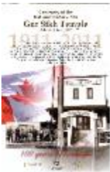
[Poster titled, centenary of the national historic site, Gur Sikh Temple, Abbotsford] (2022_01_01_01_074)