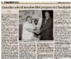
[Newspaper clipping titled, Canadian school launches BBA program in Chandigarh] (2022_01_01_01_009)