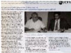
[Newspaper clipping titled, UCFV's Bachelor of Business Administration degree is going global] (2022_01_01_01_016)