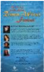
[Poster titled, Ehsaas South Asian readers and writers festival] (2022_01_01_01_066)