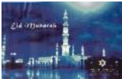
[Poster titled, Eid Mubarak] (2022_01_01_01_054)