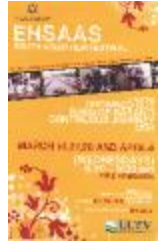
[Poster titled, Ehsaas, South Asian film festival] (2022_01_01_01_052)