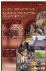
[Poster titled, Landscapes of Punjab: regional perspectives] (2022_01_01_01_047)