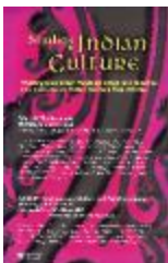
Studies in Indian culture [poster] (2022_01_01_01_012)