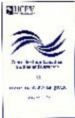
[Centre for Indo-Canadian Studies: new horizons gala program] (2022_01_01_01_002)