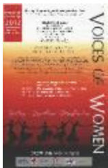
[Poster titled, Voices of women] (2022_01_01_01_059)