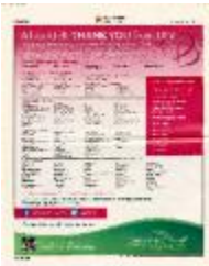
[Newspaper clipping titled, a heartfelt thank you from UFV] (2022_01_01_01_073)