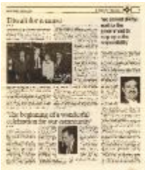
[Newspaper clipping titled, Diwali for a cause] (2022_01_01_01_072)