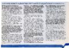
[Newspaper clipping titled, Community comes through and helps UCFV meet financial goal for Indo-Canadian centre] (2022_01_01_01_017)