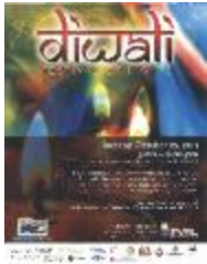
[Poster titled, Diwali festival of lights] (2022_01_01_01_057)