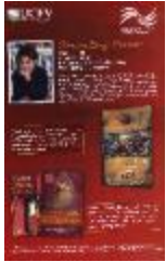
[Poster titled, Shauna Singh Baldwin public book reading and signing] (2022_01_01_01_008)