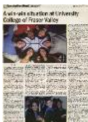
[Newspaper clipping titled: A win-win situation at University College of Fraser Valley] (2022_01_01_01_024)