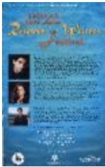
[Poster titled, Ehsaas South Asian readers and writers festival] (2022_01_01_01_067)