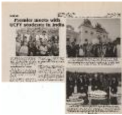
[Newspaper clipping titled, Premier meets with UCFV students in India] (2022_01_01_01_041)