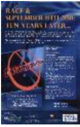
[Poster titled, Race and September 11th 2001: ten years later] (2022_01_01_01_069)