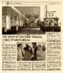
[100 years of Gur Sikh Temple, 1 year of celebrations] (2022_01_01_01_078)