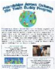
[Poster titled, Friendships across cultures - the youth buddy program] (2022_01_01_01_055)