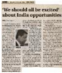
[Newspaper clipping titled, We should all be excited about india opportunities] (2022_01_01_01_026)