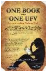
[Poster titled, One book, one UFV] (2022_01_01_01_065)