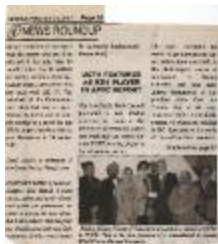
[Newspaper clipping highlighting, Centre for Indo-Canadian Studies: Khalsa Diwan Society of Vancouver donates $5000 to UCFV] (2022_01_01_01_022)