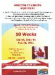
[Poster titled, Welcome to Canada, now what] (2022_01_01_01_062)