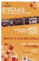
[Poster titled, Ehsaas, South Asian film festival] (2022_01_01_01_037)