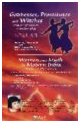
[Poster titled, Goddesses, prostitutes and witches] (2022_01_01_01_048)