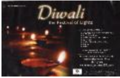
[Poster titled, Diwali the festival of lights] (2022_01_01_01_070)