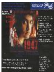
[Centre for Indo-Canadian Studies: Film screening of 1947 Earth] (2022_01_01_01_006)