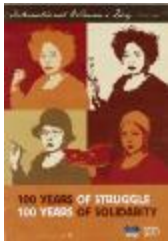
[Poster titled, International Women's Day 1911-2011] (2022_01_01_01_060)