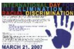
[Brochure for "International day for the elimination of racial discrimination"] (2022_01_01_01_050)