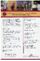
[Poster titled, Shastri Institute Mount Allison University summer program in India] (2022_01_01_01_051)