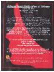
[Poster titled, International celebration of women] (2022_01_01_01_063)