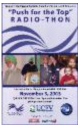
[Poster titled, Push for the top radio-thon] (2022_01_01_01_005)