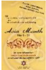
[Poster titled, Join the center for Indo Canadian studies and international education celebrating Asia month] (2022_01_01_01_046)