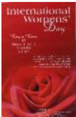
[Poster titled, Internation Womens' Day] (2022_01_01_01_061)