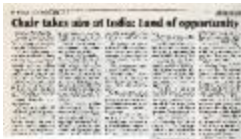
[Chair takes aim at India: land of opportunity] (2022_01_01_01_031)