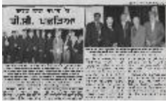
[Newspaper clipping titled: BC is behind in trade with India] (2022_01_01_01_040)