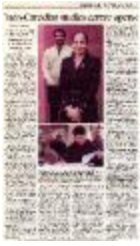
[Newspaper clipping titled, Indo-Canadian studies centre opens] (2022_01_01_01_001)