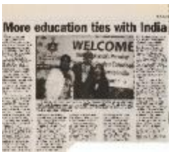
[Newspaper clipping titled, More education ties with India] (2022_01_01_01_042)