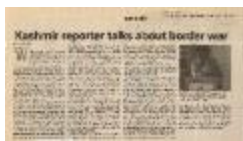
[Newspaper clipping titled, Kashmir Reporter talks about border war] (2022_01_01_01_035)