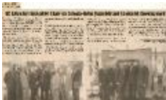
[Newspaper clipping titled, BC regional innovation chair on Canada-India business and economic development] (2022_01_01_01_032)