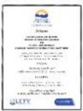
[Invitation: Announcement of Canada-India business and economic development] (2022_01_01_01_029)