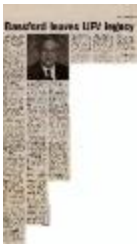
[Newspaper clipping tilted, Bassford leaves UFV legacy] (2022_01_01_01_043)