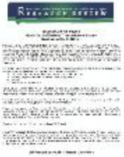
University College of the Fraser Valley research review [poster] (2022_01_01_01_058)