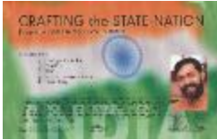
[Poster titled, Crafting the state-nation: diversity and democracy in India] (2022_01_01_01_064)