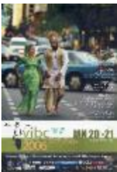
[Poster titled, Vancouver international bhangra celebration] (2022_01_01_01_044)