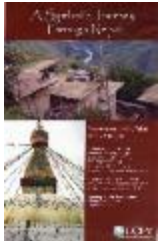
A symbolic journey through Nepal [poster] (2022_01_01_01_020)