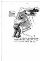
Large batch of protests sent to Ottawa by B.C. (2021_07_10820)