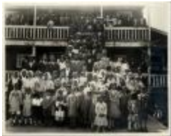
[Group on temple steps] (2021_07_10265)