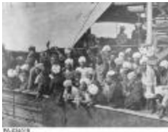
Indian immigrants on board the KOMAGATA MARU in English Bay, Vancouver, British Columbia, 1914 (2021_07_10588)