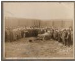
Cremating remains of Hasanam Koor (2021_07_10270)