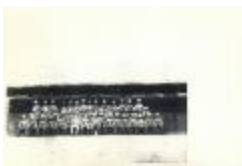
[Sikh regiment in B.C. after Queen Victoria's Jubilee] (2021_07_10281)