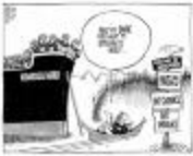
[Are you sure you want to immigrate here?] (2021_07_10813)