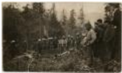
Sikh cremation (2021_07_10575)