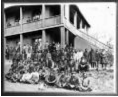
[Group photo in front of Old Gurdwara, Victoria] (2021_07_10263)