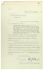
Copy of letter from Reid to W. D. Scott re provision of water (2021_07_10709)