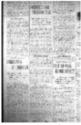
Newsclipping - Vancouver News-Advertiser: Consignees may provision Maru. Page 1 (2021_07_10501)