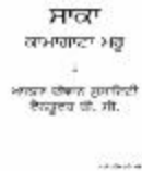
The Incident of Komagata Maru and the Role of the Khalsa Diwan Society, Vancouver, B.C (2021_07_1359)