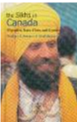
The Sikhs in Canada: Migration, Race, Class, and Gender (Excerpts) (2021_07_1013)