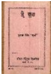
Three Virtues (2021_07_2416)