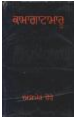
Kamagata Maru (full play) (2021_07_1878)