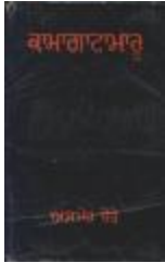
Kamagata Maru (full play) (2021_07_1495)