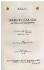
Sikhs in Canada (A Centennial Celebration) (2021_07_1716)