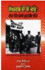
sangharash de sau vre: kaneda vich panjabi pragatisheel lahar = One Hundred Years of Struggle: Punjabi Progressive Movement in Canada (2021_07_601)