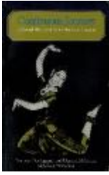
Continuous Journey: A Social History of South Asians in Canada (2021_07_292)