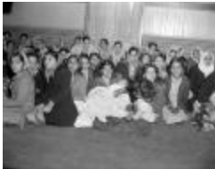
[Women and children inside the Khalsa Diwan Society] Sikh Temple (2021_07_10632)