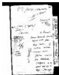
[Harcourt to Governor General, Canada, with related material] (2021_07_5279)