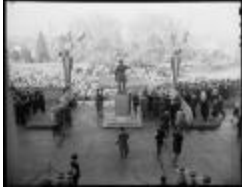
Visit of state, Pandit Nehru at City Hall (2021_07_10523)