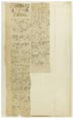
Newsclipping - W. C. Hopkinson was killed by Hindu this morning (2021_07_3309)