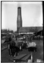
Barnet workers (2021_07_10573)