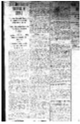
Newsclipping - Vancouver Daily Province: Bela Singh tells of shooting in temple. Page 7 (2021_07_10507)