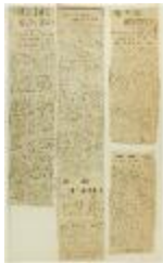
Newsclippings - Serious charge against Hindus; Charge of murder laid against Hindu; Hindu sues bank, queer story told; Three more Hindus (2021_07_10803)