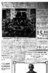
Newsclipping - Vancouver World: Thousands of citizens salute remains of the late Inspector Hopkinson on way to cemetery (2021_07_10455)