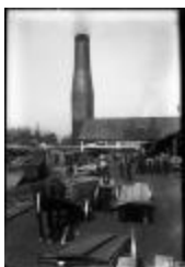
Barnet workers (2021_07_10573)