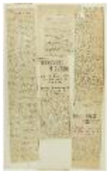
Newsclippings - Hindus and Japanese; Do not want Jap fishermen; Sohan Lal says he is a victim; Number of Japanese in this province (2021_07_10781)