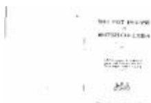
The East Indians in British Columbia: A report regarding the proposal to provide work in British Honduras for the indigent unemployed among them (2021_07_5256)