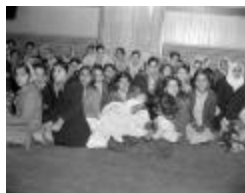
[Women and children inside the Khalsa Diwan Society] Sikh Temple (2021_07_10632)