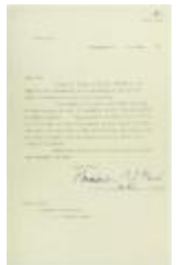
Copy of letter from Reid to Daljit Singh re responsibility for supplying food (2021_07_10682)