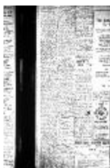
Newsclipping - Vancouver Daily Province: Inspector Hopkinson (2021_07_10452)