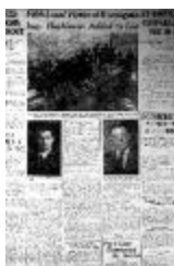
Newsclipping - Vancouver Sun: Fifth local victim of Komagata: Insp. Hopkinson added to list (2021_07_5110)