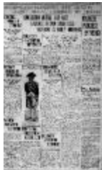
Newsclipping - Vancouver World: Inspector Hopkinson shot dead in court house corridor by Hindoo (2021_07_5383)