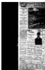
Newsclipping - Vancouver Daily Province: W. C. Hopkinson was killed by Hindu this morning (2021_07_5107)