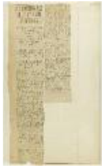
Newsclipping - W. C. Hopkinson was killed by Hindu this morning (2021_07_3309)