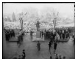
Visit of state, Pandit Nehru at City Hall (2021_07_10523)