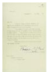
Copy of letter from Reid to Daljit Singh re responsibility for supplying food (2021_07_10682)