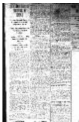
Newsclipping - Vancouver Daily Province: Bela Singh tells of shooting in temple. Page 7 (2021_07_10507)