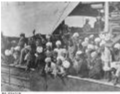
Indian immigrants on board the KOMAGATA MARU in English Bay, Vancouver, British Columbia, 1914 (2021_07_10588)