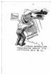
Large batch of protests sent to Ottawa by B.C. (2021_07_10820)