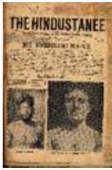
The Hindustanee. Vol. 1, no. IV (2021_07_2034)