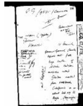
[Harcourt to Governor General, Canada, with related material] (2021_07_5279)