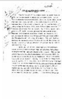
Note on the Hindu Revolutionary Movement in Canada (2021_07_5232)