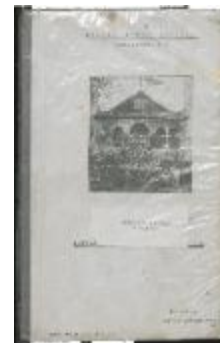
Khalsa Diwan Society [Diary], Vancouver, B.C. [: Volume 1 - English translation] (2021_07_10918)