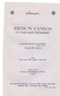
Sikhs in Canada (a centennial celebration) (2020_04_006_001)