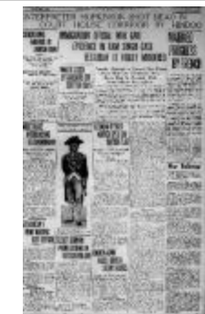
Newsclipping - Vancouver World: Inspector Hopkinson shot dead in court house corridor by Hindoo (2021_07_5383)