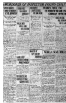
Newsclipping - Vancouver World: Muder of Inspector found guilty (2021_07_5116)