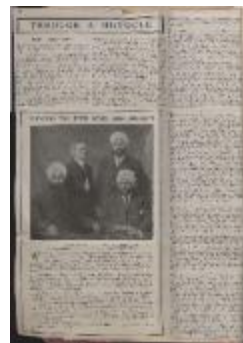
[Komagata Maru scrapbook] (2021_07_2181)