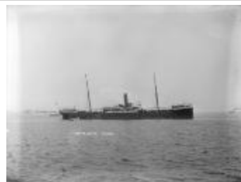
['Komagata Maru' in Vancouver harbour] (2021_07_10624)