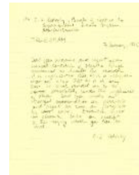
[Charles J. Doherty, Minister of Justice, to Superintendent, Insane Asylum, New Westminster, re mental condition of Mewa]