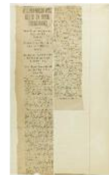
Newsclipping - W. C. Hopkinson was killed by Hindu this morning (2021_07_3309)