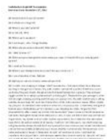
[Transcription of interview with Sukhdarshan Singh Gill] (2022_16_40_003)