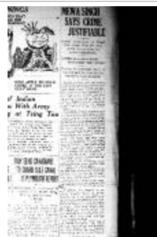
Newsclipping - Vancouver Sun: Mewa Singh says crime justifiable (2021_07_5122)