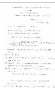
In the court of Oyer & Terminer & General Gaol Delivery. Vancouver Fall Assizes. (Before The Honorable Mr. Justice