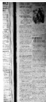
Newsclipping - Vancouver News-Advertiser: Officer is shot down by assassin (2021_07_5113)