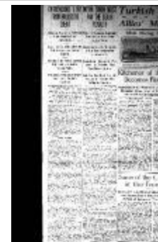
Newsclipping - Vancouver Daily Province: Mewa Singh must pay the death penalty (2021_07_5119)