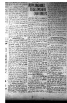
Newsclipping - Vancouver World: Mewa Singh goes to gallows with chant on lips. Page 2 (2021_07_10466)