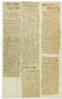
Newsclippings - Serious charge against Hindus; Charge of murder laid against Hindu; Hindu sues bank, queer story told;