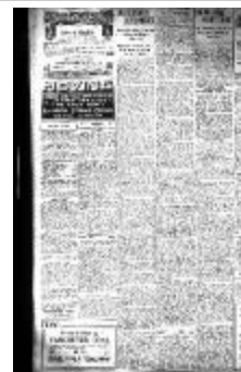
Newsclipping - Vancouver Daily Province: Swear Sohan Lal incited murder (2021_07_10464)