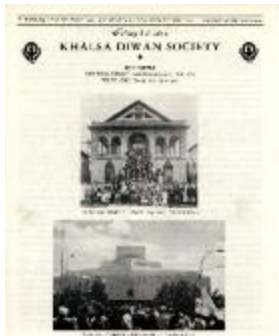
Khalsa Diwan Society (2020_04_004_036)