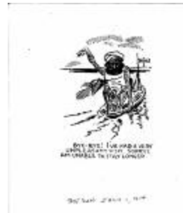
Bye-bye! I've had a very unpleasant visit. Sorry I am unable to stay longer. (2021_07_10822)