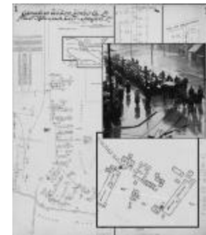
[Mewa Singh's funeral procession with maps in the background] (2021_08_01_024)