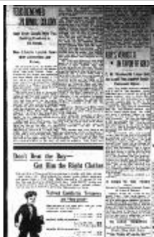
Newsclipping - Vancouver Daily Province: Feud renewed in Hindu colony. Page 3 (2021_07_10467)