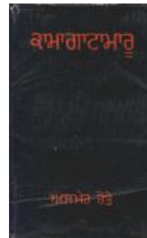
Kamagata Maru (full play) (2021_07_1495)