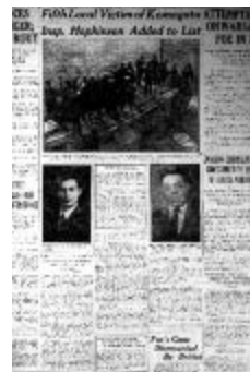
Newsclipping - Vancouver Sun: Fifth local victim of Komagata: Insp. Hopkinson added to list (2021_07_5110)