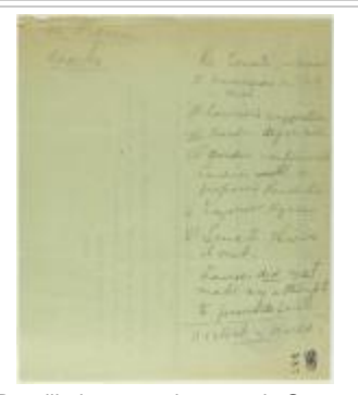
Pencilled notes re increase in Senate (2021_07_10762)