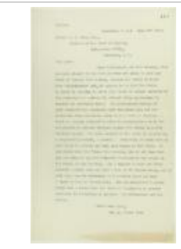
Copy of letter from J. E. Bird to Reid, criticising conduct of Board of Enquiry (2021_07_10692)