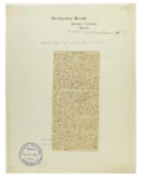
Newsclipping - Vancouver Sun: B.C. and the Hindus (2021_07_10789)