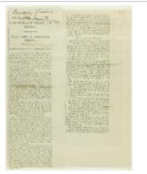
Newsclipping - Conspiracy trial in India (2021_07_10787)