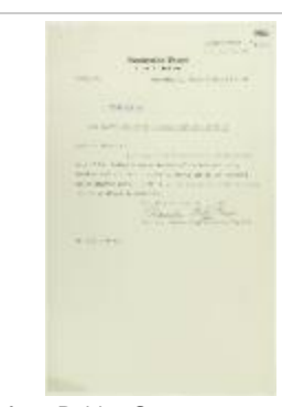
Letter from Reid to Stevens re an account of the Komagatu Maru (2021_07_10772)