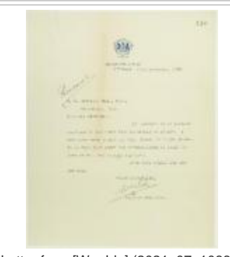
Letter from [Wm Ide] (2021_07_10668)