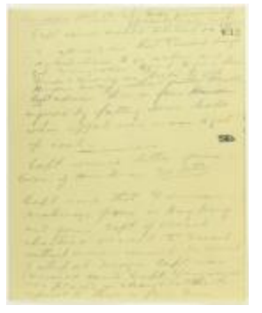
Rough notes of incidents re visit to the Maru, an incident at the Sikh Temple and damage to the Sea Lion. Page 1-4