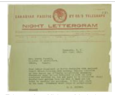
Telegram from Minister of Agriculture to Stevens re avoidance of renewed Hindu agitation (2021_07_10667)