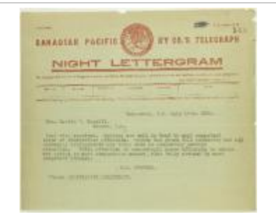
Copy of telegram from Stevens to Burrell re all necessary arrangements being made (2021_07_10770)