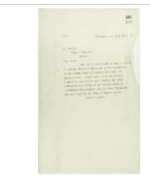
Copy of letter, unsigned, to Mr. Griffin, House of Commons, requesting references to deportation of rioters from South Africa