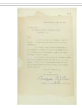
Copy of letter from Reid to Y. Hori, acknowledging words of appreciation (2021_07_10726)