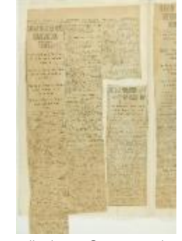
Newsclippings - Swear murder was advocated in temple; Baboo Singh committed; Bela is acquitted by assize jury