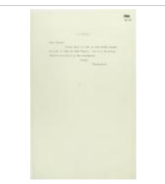
Covering letter re following account to be submitted to newspapers (2021_07_10780)