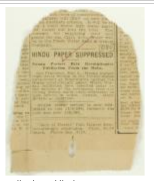
Newsclipping - Hindu paper suppressed (2021_07_10810)