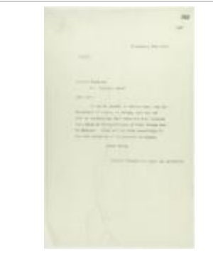
Copy of letter from Reid to Capt. Yamamoto re enforcement of Canadian law (2021_07_10753)