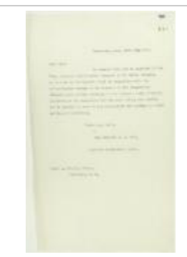
Copy of letter from Reid to Capt. G. Godson acknowledging receipt of rifles (2021_07_10748)