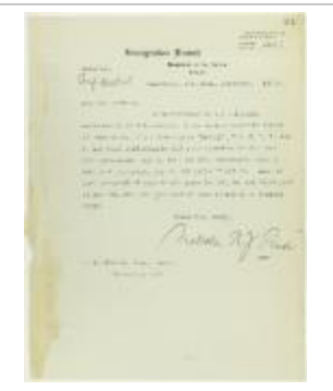
Letter from Malcolm Reid to Stevens enclosing translations of the Hindu paper 'Mutiny' (2021_07_10655)