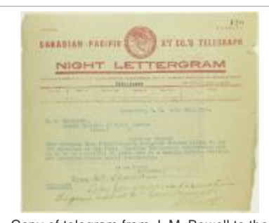
Copy of telegram from J. M. Bowell to the Deputy Minister of Naval Service re clearance of the Komagatu Maru (2021_07_10723)