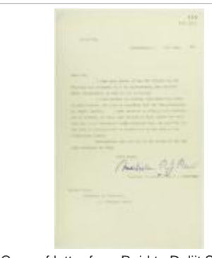
Copy of letter from Reid to Daljit Singh re responsibility for supplying food (2021_07_10682)