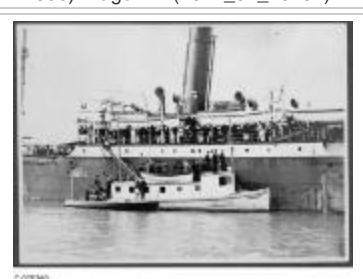
[Sikhs on board the "Komagatamaru", Vancouver, BC] (2021_07_10591)