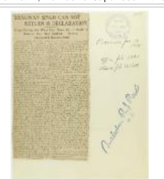
Newsclipping - Vancouver Daily Province: Bhagwan Singh can not return is declaration (2021_07_10785)