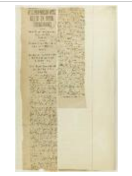
Newsclipping - W. C. Hopkinson was killed by Hindu this morning (2021_07_3309)