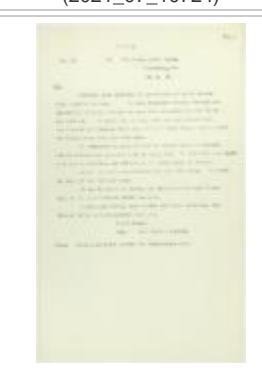
Copy of letter from passengers to the Immigration Agent re provisions (2021_07_10728)