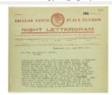
Copy of telegram from Stevens to R. L. Borden re skirmishes (2021_07_1043)