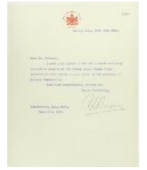
Letter from R. L. Borden to Stevens, acknowledging communication (2021_07_10735)