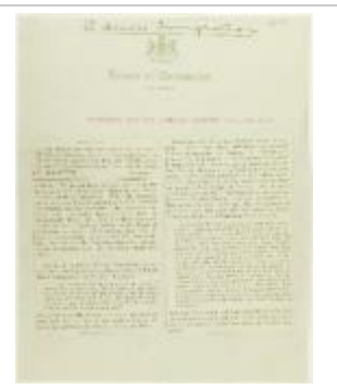
Newsclipping - Vancouver Daily Province: Re Hindoo immigration (2021_07_10790)