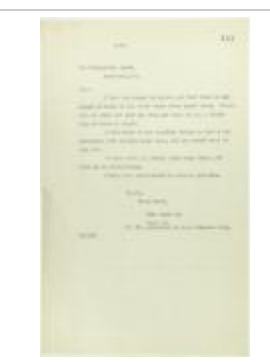
Copy of letter from the passengers on S. S. Komagatu Maru to the Immigration Agent re lack of water (2021_07_10708)