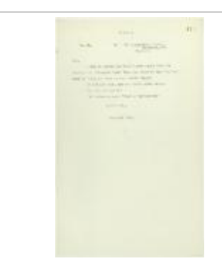
Copy of letter, unsigned, to the Immigration Agent (2021_07_10732)