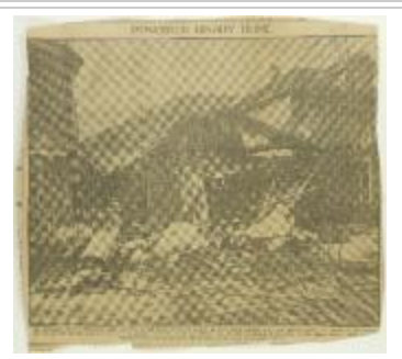
Newsclipping - Dynamited Hindus' home (2021_07_10811)