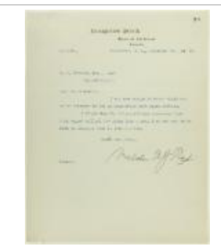
Letter from Malcolm Reid to Stevens, enclosing telegrams (2021_07_10660)