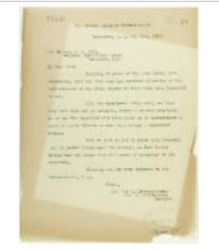
Copy of letter from The B.C. Federationist per R. P. Pettipiece re control of immigration (2021_07_10659)