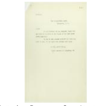
Letter from Passengers Committee to Reid re provisions (2021_07_10927)