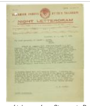
Copy of telegram from Stevens to R. L. Borden re departure of ship and antagonism of the Japanese consul (2021_07_10742)