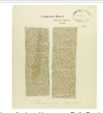
Newsclipping - Vancouver Daily Province: Treatment of Hindus (2021_07_10788)