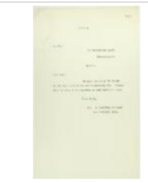
Copy of letter from Committee on ship to Reid re sickness (2021_07_10738)