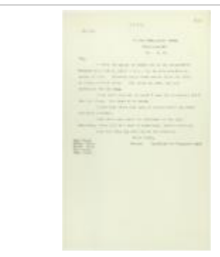
Copy of letter from passengers to the Immigration Agent requesting provisions (2021_07_10730)