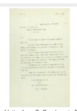
Copy of letter from S. Garnham to Reid re night watch (2021_07_10737)