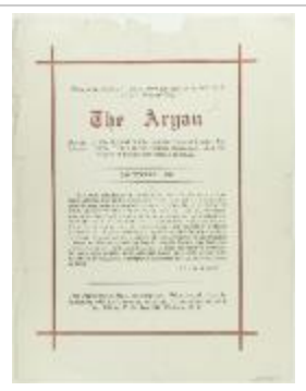
The Aryan (2021_07_3181)