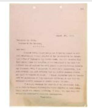
Copy of letter, unsigned, to Dr. Roche, Minister of the Interior re threatened influx of Hindus to Pacific Coast (2021_07_10653)