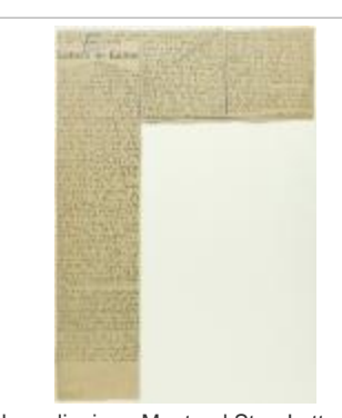
Newsclipping - Montreal Star: Letters to Editor: Asiatic immigration (2021_07_10782)