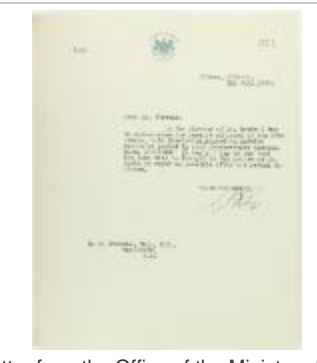
Letter from the Office of the Minister of the Interior to Stevens acknowledging Resolution re Asiatic exclusion passed by