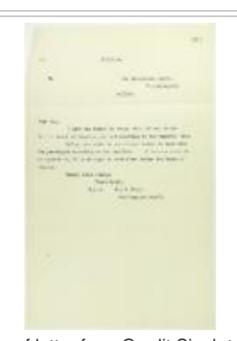
Copy of letter from Gurdit Singh to the Immigration Agent re calling before the Board of Enquiry (2021_07_10701)