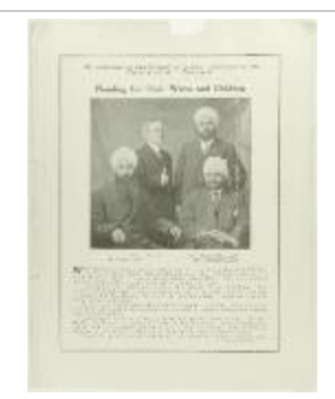
Newsclipping - Pleading for their wives and children (2021_07_10802)