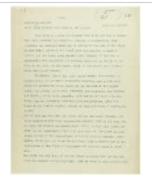
Copies of leases granted to Grand Trunk Pacific Railway Co. Page 1-9. With additional lease information (2021_07_3113)