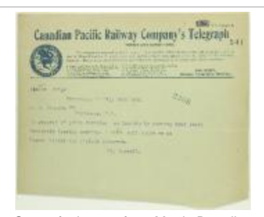
Copy of telegram from Martin Burrell to Stevens (2021_07_10760)