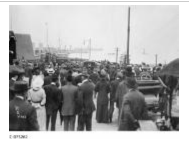
Crowds gathered to watch Sikhs on board the "Komatagamaru"[sic], Vancouver, BC (2021_07_10589)