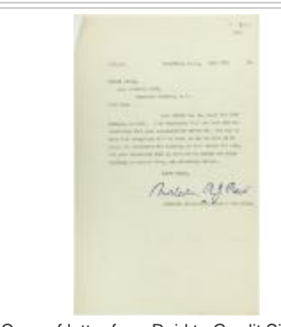
Copy of letter from Reid to Gurdit Singh re provisioning (2021_07_10690)