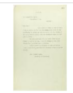
Copy of letter from Daljit Singh to the Immigration Agent (2021_07_10705)