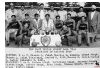
[Group photo of the Youbou Rockets at Champions of Vaisakhi 1956, Youbou, B.C.] (2023_06_01_025)