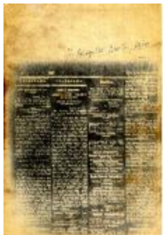
Newsclipping - The Bengalee: Sikhs at Vancouver: extraordinary sequence of tragedies (2021_07_10446)