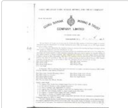
Sikhs organize Guru Nanak Mining and Trust Company (2023_17_02_003)