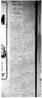
Newsclipping - Vancouver News-Advertiser: Seditious at work in temple (2021_07_10458)