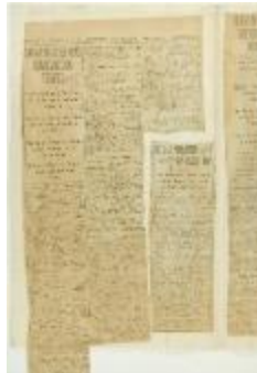
Newsclippings - Swear murder was advocated in temple; Baboo Singh committed; Bela is acquitted by assize jury