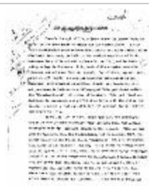
Note on the Hindu Revolutionary Movement in Canada (2021_07_5232)