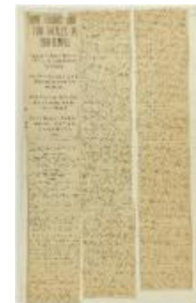
Newsclipping - Nine Hindus shot, two fatally, in Sikh temple (2021_07_10808)