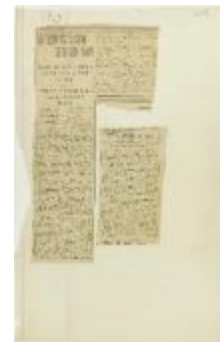
Newsclippings - Attempts to sow sedition vain; Bela Singh in box (2021_07_10799)