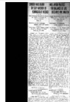
Newsp clipping - Vancouver Sun: Cruiser was ready to slip anchor of Komagata if needed (2021_07_5402)