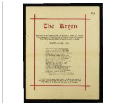
The Aryan, March - April 1912, Vol. II (2023_20_001)