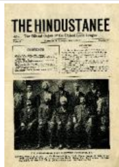
The Hindustanee: The Official Organ of the United India League. Volume 1, Number 3 (2021_07_10923)