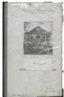
Khalsa Diwan Society [Diary], Vancouver, B.C. [: Volume 1 - English translation] (2021_07_10918)