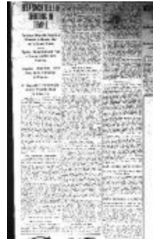
Newsclipping - Vancouver Daily Province: Bela Singh tells of shooting in temple. Page 7 (2021_07_10507)