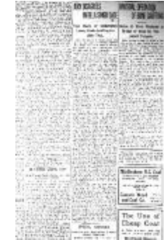
Newsclipping - Vancouver Daily Province: Jury disagrees in Bela Singh case. Page 24 (2021_07_10460)