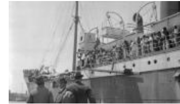
S. S. 'Komagata Maru' [and Canadian officials] (2021_07_10614)