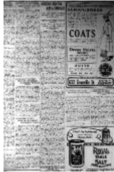
Newsclipping - Vancouver Sun: Verdict of acquittal in Bela Singh case. Page 2 (2021_07_10462)