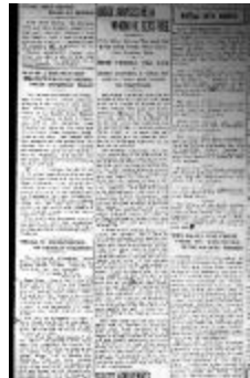
Newsclipping - Vancouver Sun: Judge advises Bela whom he sets free. Page 3 (2021_07_10463)