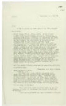
Copy of letter from Reid to W. D. Scott confirming telegrams re purchase of revolvers by Hindus. Page 1-2