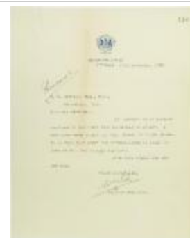
Letter from [Wm Ide] (2021_07_10668)