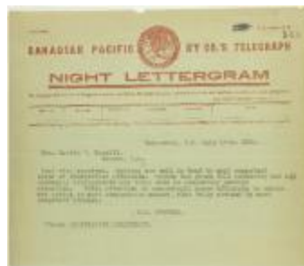
Copy of telegram from Stevens to Burrell re all necessary arrangements being made (2021_07_10770)