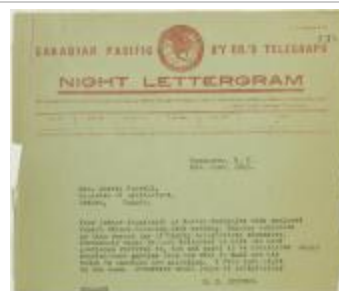
Telegram from Minister of Agriculture to Stevens re avoidance of renewed Hindu agitation (2021_07_10667)