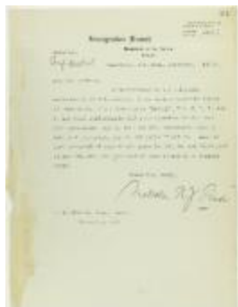
Letter from Malcolm Reid to Stevens enclosing translations of the Hindu paper 'Mutiny' (2021_07_10655)