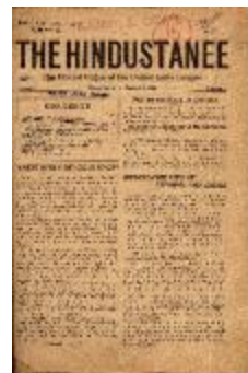
The Hindustanee. Vol. 1, no. I (2021_07_2014)