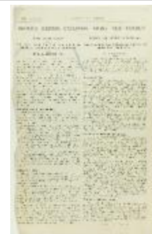
Newsclipping - Should British Columbia admit the Hindu? (2021_07_4131)