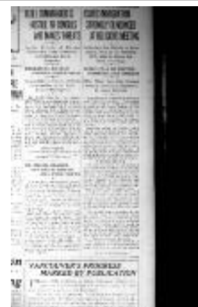
Newsclipping - Vancouver Sun: Asiatic immigration strongly denounced at religious meeting (2021_07_5390)