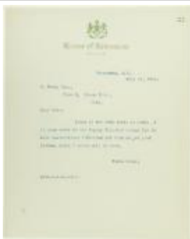
Copy of letter from Stevens to E. Read (2021_07_10645)