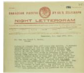
Copy of telegram from Stevens to R. L. Borden re skirmishes (2021_07_1043)