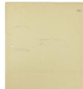
Copy of translated extracts of 'The Mutiny' No. 14. Cover-page 2 (2021_07_9384)