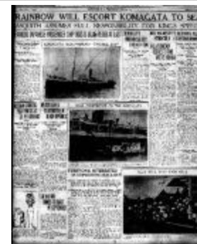
Newsclipping - Vancouver World: Rainbow will escort Komagata to sea (2021_07_5186)