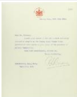
Letter from R. L. Borden to Stevens, acknowledging communication (2021_07_10735)