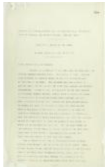
Minutes of a public meeting held in Dominion Hall. Page 1-23 (2021_07_10251)