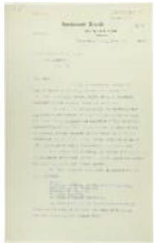
Letter from Reid to Stevens, answering complaints of the Vancouver Conservative Association. Page 1-5 (2021_07_15)