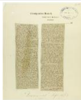
Newsclipping - Vancouver Daily Province: Treatment of Hindus (2021_07_10788)