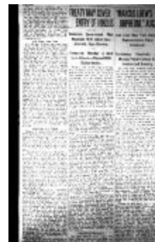
Newsclipping - Vancouver Daily Province: Treaty may cover entry of Hindus. Page 1 (2021_07_10485)