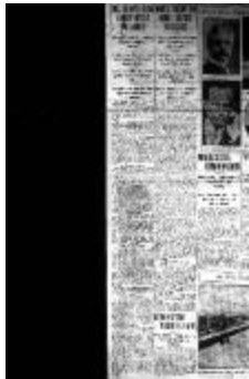
Newsclipping - Vancouver Daily Province: Mr. Stevens fears a riot if Hindus are landed (2021_07_10489)