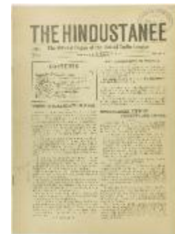
The Hindustanee Volume 1 No. 1 Page 1-8 (2021_07_3122)