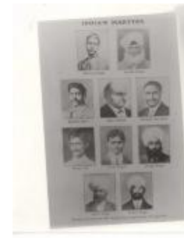
India's Martyrs (2021_07_10267)