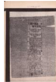
Newsclipping - Vancouver Daily Province: Hindu problem may be solved (2021_07_10528)