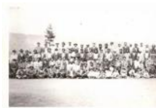
[Mayo Lumber workers] (2021_07_10261)