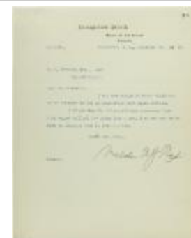
Letter from Malcolm Reid to Stevens, enclosing telegrams (2021_07_10660)