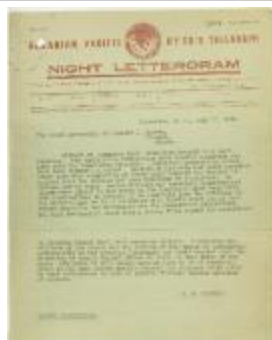
Copy of telegram from Stevens to R. L. Borden re departure of ship and antagonism of the Japanese consul (2021_07_10742)