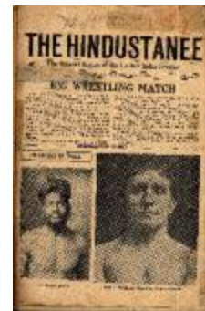
The Hindustanee. Vol. 1, no. IV (2021_07_2034)