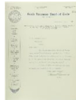
Letter from South Vancouver Board of Trade to Stevens re endorsement of stand towards Komagatu Maru (2021_07_10714)