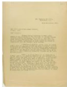
Copy of letter from Stevens to Meighen re immigration and enfranchisement, and Liberal responsibility in the matter. Page 1-2