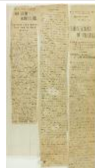
Newsclippings - Vancouver Daily Province: Committed on murder charge; A coming issue; Victoria Daily Colonist: Large number