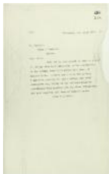
Copy of letter, unsigned, to Mr. Griffin, House of Commons, requesting references to deportation of rioters from South Africa