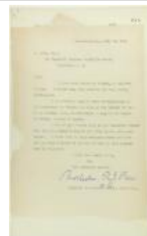
Copy of letter from Reid to Y. Hori, acknowledging words of appreciation (2021_07_10726)