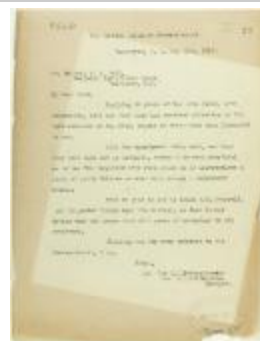
Copy of letter from The B.C. Federationist per R. P. Pettipiece re control of immigration (2021_07_10659)