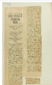
Newsclipping - Desire removal of embargo on Hindus (2021_07_10804)