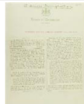
Newsclipping - Vancouver Daily Province: Re Hindoo immigration (2021_07_10790)