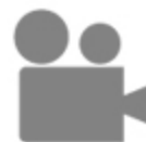
The Komagata Maru: Voyage of Shattered Dreams (2021_07_10847)