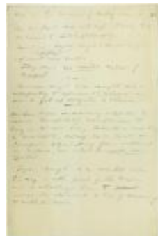
Draft of report re delegation personnel (2021_07_9292)