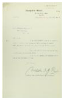
Letter from Reid to Stevens re news leakage (2021_07_10715)