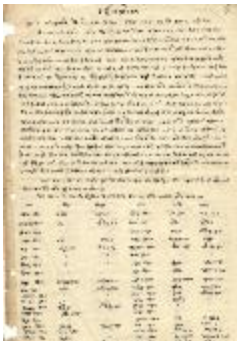
[Komagata Maru passenger list] (2021_07_1885)