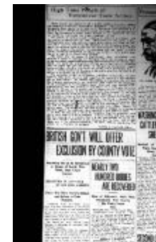
Newsclipping - Vancouver World: High time people of Vancouver took action. Page 1 (2021_07_10488)