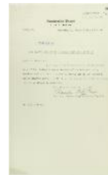
Letter from Reid to Stevens re an account of the Komagatu Maru (2021_07_10772)