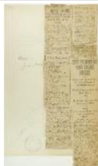
Newsclippings - Vancouver Daily Province: Full instructions coming tomorrow; Against alien labor; Sang the doxology when license