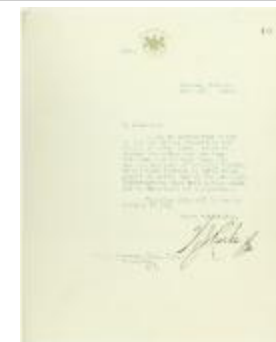
Letter from Minister of the Interior (see p. 39) (2021_07_10648)