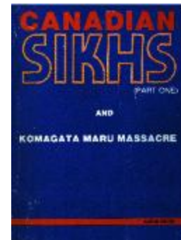
Canadian Sikhs (Part One) and Komagata Maru Massacre (2021_07_6295)