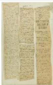
Newsclippings - Happily ended; Stevens speaks in defence of Dominion Gov't; Hindus' lawyer had suggestion of settlement