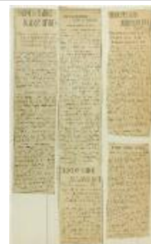
Newsclippings - Serious charge against Hindus; Charge of murder laid against Hindu; Hindu sues bank, queer story told;