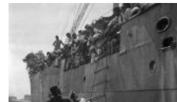
S. S. 'Komagata Maru' (2021_07_10612)