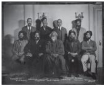
[Khalsa Diwan organizers] (2021_05_048)