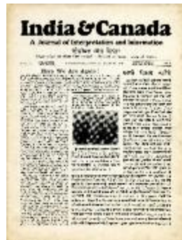
India & Canada: A Journal of Interpretation and Information. Vol. II, no. 1 (2021_07_1037)