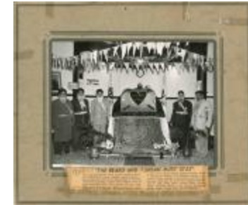
[Group photograph of six men at Victoria gurdwara] (2023_04_01_009)