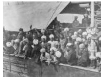
Indian immigrants on board the KOMAGATA MARU in English Bay, Vancouver, British Columbia, 1914 (2021_07_10588)