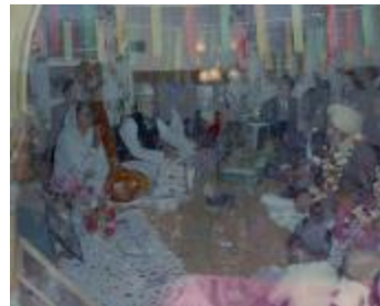
[Photo of Kartar Singh with an unidentified bride] (2020_03_F00208_030)