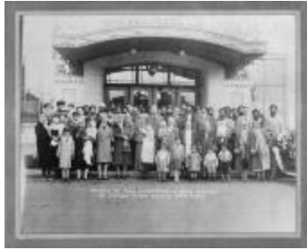
Welcome to Revd. C. F. Andrews at G. N. R. Station by Khalsa Diwan Society, April 5, 1929 (2021_07_10282)