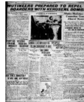
Newsclipping - Vancouver World: Mutineers prepared to repel boarders with kerosene bombs (2021_07_5183)