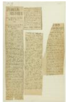
Newsclippings - Says Hindus are most patriotic; Echoes of Komagata; Singh denied [tale] of conspiracy (2021_07_10800)