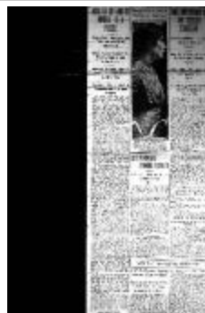
Newsclipping - Vancouver Daily Province: How to get rid of Hindus is a puzzle. Page 1 (2021_07_10486)