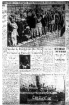
Newsclipping - Vancouver Daily Province: Smoke is rising from the Maru to leave at five a.m. tomorrow (2021_07_5165)