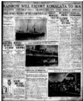
Newsclipping - Vancouver World: Rainbow will escort Komagata to sea (2021_07_5186)