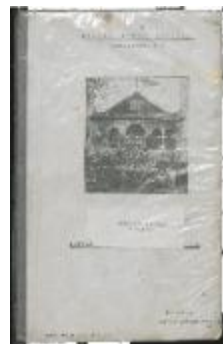
Khalsa Diwan Society [Diary], Vancouver, B.C. [Volume 1 - English translation] (2021_07_10918)