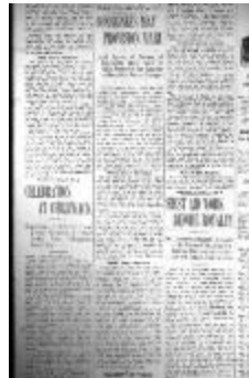
Newsclipping - Vancouver News-Advertiser: Consignees may provision Maru. Page 1 (2021_07_10501)