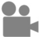
The story of the Komagata Maru or Komagata Maru: One hundred years later (2021_07_10856)