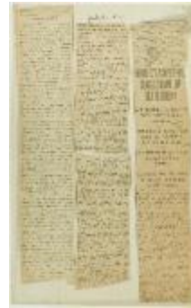
Newsclippings - Happily ended; Stevens speaks in defence of Dominion Gov't; Hindus' lawyer had suggestion of settlement