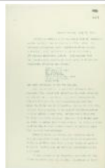
Unsigned, account of conference on board the Rainbow. Page 1-2 (2021_07_1752)