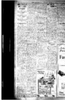
Newsclipping - Vancouver Daily Province: Hindus threaten to take to boats and escape (2021_07_10497)