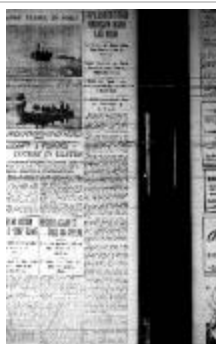
Newsclipping - Vancouver Daily Province: Jap leaped from Komagata Maru last night (2021_07_5128)