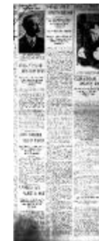
Newsclipping - Vancouver News-Advertiser: To finally wind up Komagata Maru case. Page 1 (2021_07_10472)