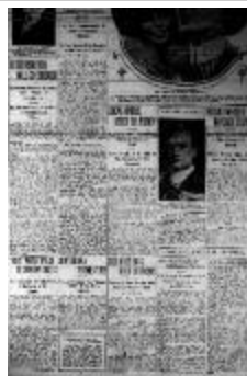
Newsclipping - Vancouver Daily Province: Local Hindus offer the money. Page 1 (2021_07_10483)