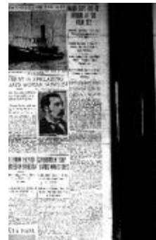
Newsclipping - Vancouver Daily Province: Maru slips out of the harbor at the hour set (2021_07_5168)