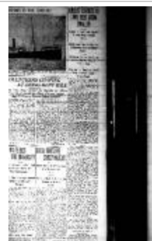
Newsclipping - Vancouver Daily Province: Hindus' chances to land here grow smaller (2021_07_5135)