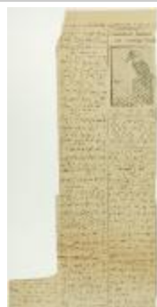
Newsclipping - Vancouver News-Advertiser: No revolt upon Komagata Maru (2021_07_3994)