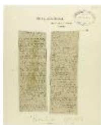
Newsclipping - Vancouver Daily Province: Treatment of Hindus (2021_07_10788)