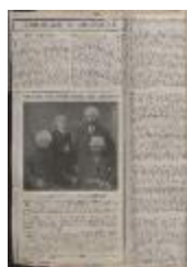
[Komagata Maru scrapbook] (2021_07_2181)