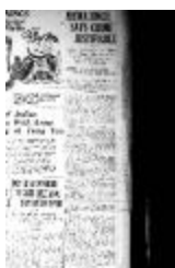
Newsclipping - Vancouver Sun: Mewa Singh says crime justifiable (2021_07_5122)