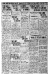
Newsclipping - Vancouver World: Muder of Inspector found guilty (2021_07_5116)