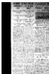
Newsclipping - Vancouver Daily Province: Mewa Singh must pay the death penalty (2021_07_5119)