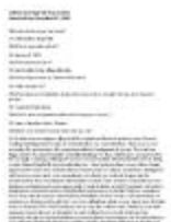
[Transcription of interview with Sukhdarshan Singh Gill] (2022_16_40_003)