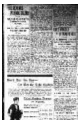
Newsclipping - Vancouver Daily Province: Feud renewed in Hindu colony. Page 3 (2021_07_10467)