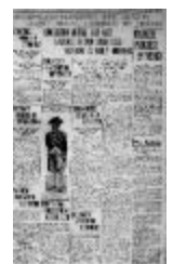
Newsclipping - Vancouver World: Inspector Hopkinson shot dead in court house corridor by Hindoo (2021_07_5383)