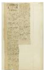
Newsclipping - W. C. Hopkinson was killed by Hindu this morning (2021_07_3309)