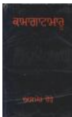
Kamagata Maru (full play) (2021_07_1495)