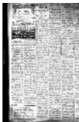
Newsclipping - Vancouver Daily Province: Swear Sohan Lal incited murder (2021_07_10464)