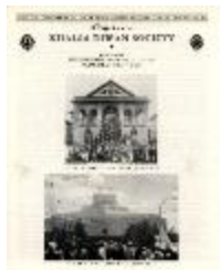
Khalsa Diwan Society (2020_04_004_036)