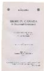
Sikhs in Canada (a centennial celebration) (2020_04_006_001)