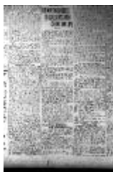
Newsclipping - Vancouver World: Mewa Singh goes to gallows with chant on lips. Page 2 (2021_07_10466)