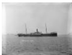
['Komagata Maru' in Vancouver harbour] (2021_07_10624)