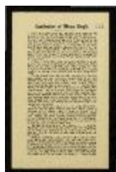
Confession of Mewa Singh (2023_20_002)