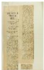
Newsclipping - Desire removal of embargo on Hindus (2021_07_10804)