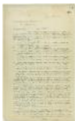
Copy of letter from M. L. Rustum to the British Consul in San Francisco, offering information for sale re Indian Revolutionary party (2021_07_10791)