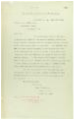
Copy of letter from Y. A. Hori, Japanese Consul, to Reid, expressing appreciation of courtesy shown the Japanese Training Squadron (2021_07_10698)