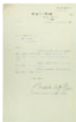
Letter from Reid to Stevens re news leakage (2021_07_10715)