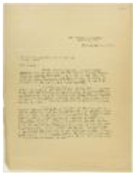
Copy of letter from Stevens to Meighen re immigration and enfranchisement, and Liberal responsibility in the matter. Page 1-2 (2021_07_2425)