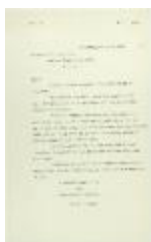
Copy of letter from S. Garnham to Reid re night watch (2021_07_10737)