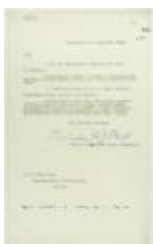
Copy of letter from Reid to W. D. Scott re emigration to India of Hindu agitators (2021_07_10774)