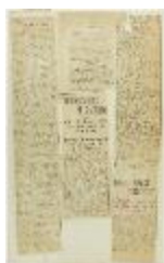
Newsclippings - Hindus and Japanese; Do not want Jap fishermen; Sohan Lal says he is a victim; Number of Japanese in this province (2021_07_10781)