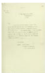
Copy of letter from Daljit Singh to the Immigration Agent re receipts for telegrams (2021_07_10670)