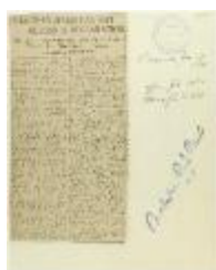
Newsclipping - Vancouver Daily Province: Bhagwan Singh can not return is declaration (2021_07_10785)