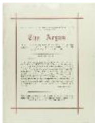
The Aryan (2021_07_3181)