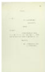
Copy of letter from Committee on ship to Reid re sickness (2021_07_10738)