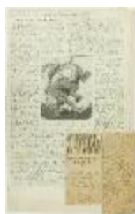
Newsclippings - American-made Hindu revolts; Warn women not to marry Hindus or the Moslems (2021_07_10786)