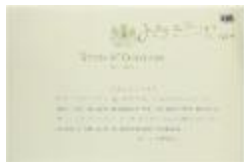
Copy of telegram from R. L. Borden, acknowledging receipt of telegrams from Stevens (2021_07_10759)