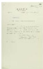
Letter from Reid to Stevens re an account of the Komagatu Maru (2021_07_10772)