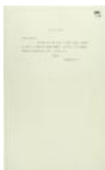
Covering letter re following account to be submitted to newspapers (2021_07_10780)