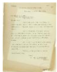
Copy of letter from The B.C. Federationist per R. P. Pettipiece re control of immigration (2021_07_10659)