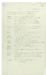
Copy of conversation between Hindus re Reid and Hopkinson (2021_07_10717)