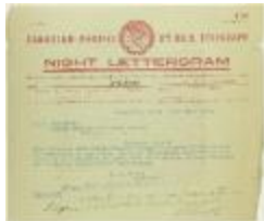
Copy of telegram from J. M. Bowell to the Deputy Minister of Naval Service re clearance of the Komagatu Maru (2021_07_10723)