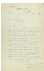
Letter from Malcolm Reid to Stevens enclosing declarations of Sikhs re tyranny, and including immigration statistics (2021_07_10688)