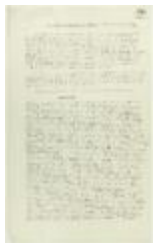
From the Second Echo of the Ghaddar (see p. 650). Page 1-3. Includes the message of the passengers of the Komagata Maru to their countrymen (2021_07_2300)