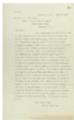
Copy of letter from J. E. Bird to Reid, criticising conduct of Board of Enquiry (2021_07_10692)