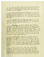
Arguments re immigration, unsigned. Page 1-2 (2021_07_2419)