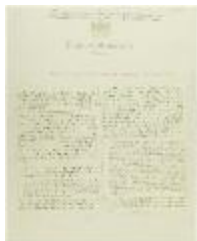
Newsclipping - Vancouver Daily Province: Re Hindoo immigration (2021_07_10790)