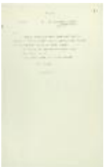
Copy of letter, unsigned, to the Immigration Agent (2021_07_10732)