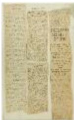
Newsclippings - Happily ended; Stevens speaks in defence of Dominion Gov't; Hindus' lawyer had suggestion of settlement (2021_07_10792)