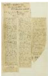
Newsclipping - Hindus blown up by dynamite in Kitsilano house (2021_07_10807)