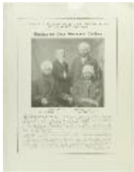
Newsclipping - Pleading for their wives and children (2021_07_10802)