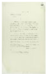
Requisition (see p. 539) (2021_07_10756)