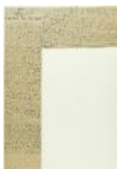
Newsclipping - Montreal Star: Letters to Editor: Asiatic immigration (2021_07_10782)