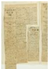
Newsclippings - Swear murder was advocated in temple; Baboo Singh committed; Bela is acquitted by assize jury (2021_07_4219)