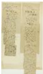
Newsclippings - Victoria Daily Colonist: Against admission of Hindu women; Hindu question is considered; Unfavorable to Hindu women (2021_07_3732)