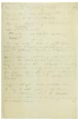
Draft of report re delegation personnel (2021_07_9292)