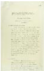
Minutes of a Hindu mass meeting held in Dominion Hall. Page 1-21 (2021_07_9506)