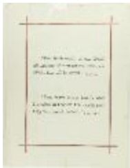
Newsclipping - [quotes] (2021_07_10801)