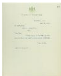
Copy of letter from H. H. Stevens to E. Read (2021_07_10649)