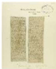
Newsclipping - Vancouver Daily Province: Treatment of Hindus (2021_07_10788)