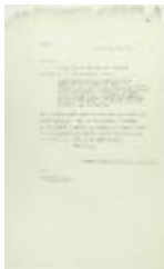
Copy of letter from Reid to Captain Yamamota re responsibility for provisions (2021_07_10724)