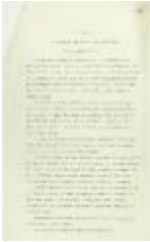
Copy of letter sent to Editor, The Daily News Advertiser, by passengers on board the Komagata Maru. Page 1-3 (2021_07_9475)