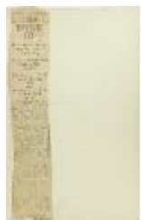
Newsclipping - Sat on Pertab till he was nearly dead (2021_07_10812)