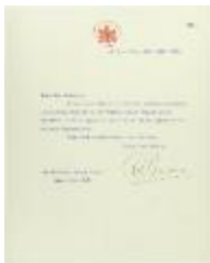
Letter from R. L. Borden to Stevens, acknowledging communication (2021_07_10735)