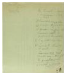
Pencilled notes re increase in Senate (2021_07_10762)