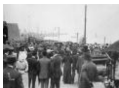
Crowds gathered to watch Sikhs on board the "Komatagamaru"[sic], Vancouver, BC (2021_07_10589)