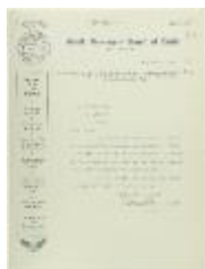
Letter from South Vancouver Board of Trade to Stevens re endorsement of stand towards Komagatu Maru (2021_07_10714)