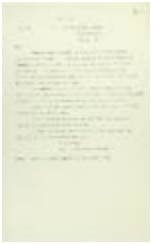
Copy of letter from passengers to the Immigration Agent re provisions (2021_07_10728)