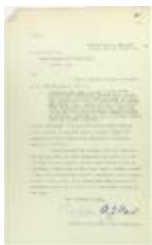
Copy of letter from Reid to W. D. Scott re provision of water (2021_07_10709)