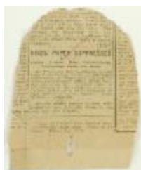
Newsclipping - Hindu paper suppressed (2021_07_10810)