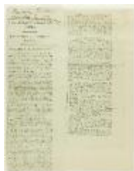
Newsclipping - Conspiracy trial in India (2021_07_10787)