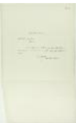
Copy of telegram, signed Passengers, sent to Governor General re shortage of water (2021_07_10703)