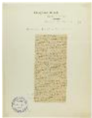
Newsclipping - Vancouver Sun: B.C. and the Hindus (2021_07_10789)