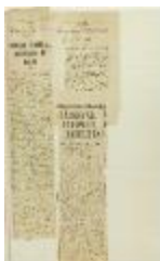
Newscippings - Vancouver World: Fishery problem discussed House; No more Japanese for B.C.; Gives new angle on character of Hindoos abroad (2021_07_3354)