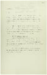
Copy of Resolution proposed at Dominion Hall (see pp. 260-282) (2021_07_10699)