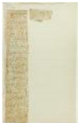
Newsclipping - Hindu immigration (2021_07_10805)