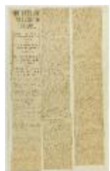
Newsclipping - Nine Hindus shot, two fatally, in Sikh temple (2021_07_10808)