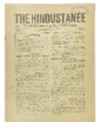
The Hindustanee Volume 1 No. 1 Page 1-8 (2021_07_3122)