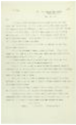
Copy of letter from passengers to the Immigration Agent re provisions (2021_07_10746)