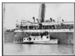
[Sikhs on board the "Komagatamaru", Vancouver, BC] (2021_07_10591)