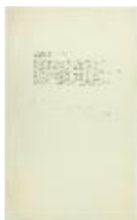
new document - [Index] N.B. pp 137-141 removed to photo collection. March 17, 1977 (2021_07_10669)