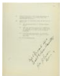
Copy of resolutions passed by Retail Merchants' Association (see p. 680) (2021_07_10776)