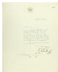
Letter from Minister of the Interior (see p. 39) (2021_07_10648)