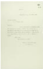
Copy of letter from Reid to Captain Yamamoto that the law must be enforced (2021_07_10750)