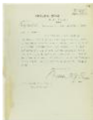
Letter from Malcolm Reid to Stevens enclosing translations of the Hindu paper 'Mutiny' (2021_07_10655)