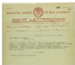
Copy of telegram from Stevens to Burrell re all necessary arrangements being made (2021_07_10770)