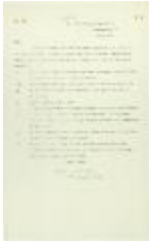
Copy of letter from Gurdit Singh to the Immigration Agent re special favours allegedly granted certain passengers (2021_07_10729)