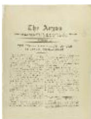
The Aryan Vol. 1 No. 5 Page 1-8 (2021_07_3263)