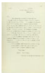
Copy of letter from Daljit Singh to the Immigration Agent complaining about difficulty in getting provisions on board (2021_07_10687)