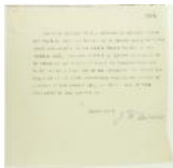
Copy of resolution passed by Council of City of North Vancouver, supporting resolution (see p. 350) (2021_07_10710)