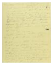
Rough notes of incidents re visit to the Maru, an incident at the Sikh Temple and damage to the Sea Lion. Page 1-4 (2021_07_2078)