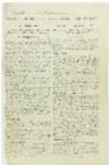
Newsclipping - Should British Columbia admit the Hindu? (2021_07_4131)