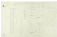
Pencilled notes re Y. A. Hori (2021_07_10751)