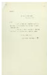
Letter from Passengers Committee to Reid re provisions (2021_07_10927)