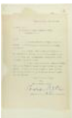
Copy of letter from Reid to Y. Hori, acknowledging words of appreciation (2021_07_10726)