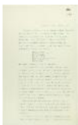
Unsigned, account of conference on board the Rainbow. Page 1-2 (2021_07_1752)