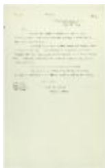
Copy of letter from passengers to the Immigration Agent re provisions (2021_07_10757)