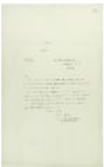
Copy of letter from Daljit Singh to the Immigration Agent re supply of fresh water (2021_07_10700)