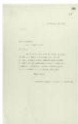
Copy of letter from Reid to Capt. Yamamoto re enforcement of Canadian law (2021_07_10753)