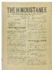
The Hindustanee Volume 1 No. 2 Page 1-8 (2021_07_3131)