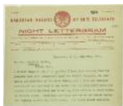
Copy of telegram from Stevens to R. L. Borden re final arrangements for Maru. Page 1-3 (2021_07_1682)