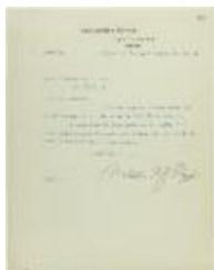
Letter from Malcolm Reid to Stevens, enclosing telegrams (2021_07_10660)