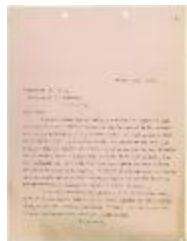
Copy of letter, unsigned, to Dr. Roche, Minister of the Interior re threatened influx of Hindus to Pacific Coast (2021_07_10653)