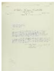
Letter from Executive of the South Vancouver Conservative Association to Stevens commending the stand taken (2021_07_10716)