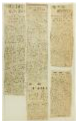
Newsclippings - Serious charge against Hindus; Charge of murder laid against Hindu; Hindu sues bank, queer story told; Three more Hindus (2021_07_10803)