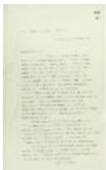
Copy of letter from W. D. Scott to Reid re Rainbow and police if needed during ship's departure (2021_07_10752)