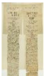
Newsclippings - Vancouver Daily Province: Declares Hindus are filthiest; Clergymen's views on the Hindu problem (2021_07_3835)