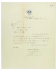
Letter from [Wm Ide] (2021_07_10668)