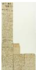
Newsclipping - Women's council and the Hindus (2021_07_3777)