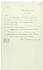
Copy of letter from passengers to the Immigration Agent requesting provisions (2021_07_10730)