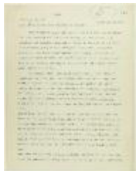
Copies of leases granted to Grand Trunk Pacific Railway Co. Page 1-9. With additional lease information (2021_07_3113)