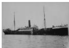
[Sikhs on board the "Komagatamaru", Vancouver, BC] (2021_07_10585)