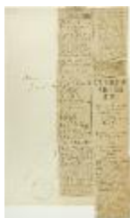
Newsclippings - Vancouver Daily Province: Full instructions coming tomorrow; Against alien labor; Sang the doxology when license refused (2021_07_10784)