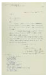
Copy of letter from Reid to Col. J. Duff Stuart re entertainment of the Japanese Training Squadron (see pp. 136b-136c) (2021_07_10711)