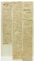
Newsclippings - Vancouver Daily Province: Committed on murder charge; A coming issue; Victoria Daily Colonist: Large number of Orientals (2021_07_4090)