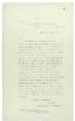
Copy of letter from W. D. Scott to Reid re press leakage (2021_07_10733)