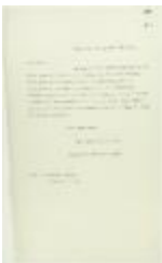
Copy of letter from Reid to Capt. G. Godson acknowledging receipt of rifles (2021_07_10748)