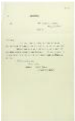
Copy of letter from Gurdit Singh to the Immigration Agent re calling before the Board of Enquiry (2021_07_10701)