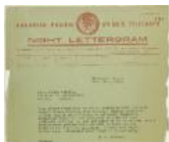
Telegram from Minister of Agriculture to Stevens re avoidance of renewed Hindu agitation (2021_07_10667)