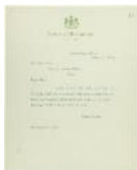
Copy of letter from Stevens to E. Read (2021_07_10645)