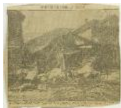
Newsclipping - Dynamited Hindus' home (2021_07_10811)