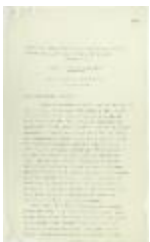
Minutes of a public meeting held in Dominion Hall. Page 1-23 (2021_07_10251)