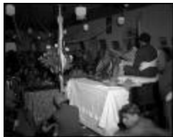
Inside the Sikh Temple during a visit by Nehru (2021_07_10581)