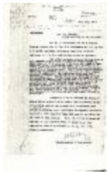
[William D. Scott, Superintendent of Immigration, to Charles J. Doherty, Minister of Justice, re Hopkinson's report on Balwant Singh and Bhag Singh. Copy] (2021_07_10338)