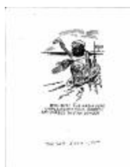
Bye-bye! I've had a very unpleasant visit. Sorry I am unable to stay longer. (2021_07_10822)