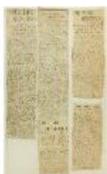
Newsclippings - Serious charge against Hindus; Charge of murder laid against Hindu; Hindu sues bank, queer story told; Three more Hindus (2021_07_10803)