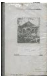
Khalsa Diwan Society [Diary], Vancouver, B.C. [: Volume 1 - English translation] (2021_07_10918)