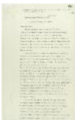
Copy of address to the Secretary of the Sikh Temple, Vancouver, unsigned. Page 1-6 (2021_07_1216)