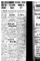
Newsclipping - Vancouver World: Sikhs bring women to city. Page 1 (2021_07_10509)