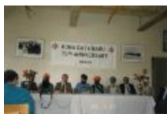
Press conference (2020_04_004_042)