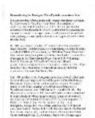
Remembering the Komagata Maru episode ... a century later (2020_04_003_005)