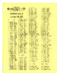
Komagata Maru passenger list (2020_04_004_035)