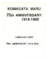
Komagata Maru 75th anniversary 1914-1989 (2020_04_004_001)