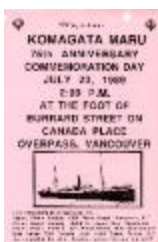
Komagata Maru 75th anniversary commemoration day (2020_04_004_003)