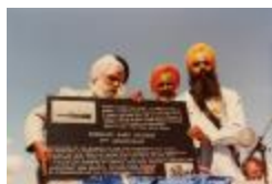
Unveiling plaque (2020_04_004_094)