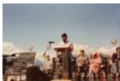
Canada Place gathering (2020_04_004_086)