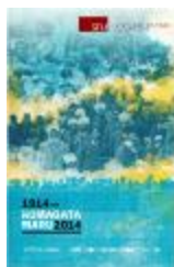
Komagata Maru 1914-2014 (2020_04_003_011)