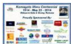
Komagata Maru centennial welcome gala and stamp release (2020_04_003_013)