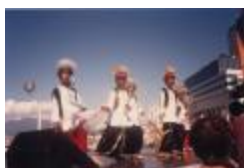
Bhangra : Richmond Punjabi Artists Assoc. (2020_04_004_098)