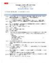
Speaker's schedule - Panel (2020_04_003_004)