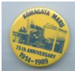
Komagata Maru 75th anniversary commemorative button (2020_04_001_001)