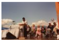
Opening by master of ceremony (2020_04_004_060)