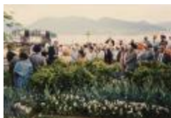
Plaque unveiling at Portal Park (2020_04_004_107)