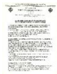
Activities planned to commemorate the Komagata Maru incident in 1989 (2020_04_004_007)