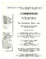
Commemorate the 75th anniversary of the forcible ouster of the Komagata Maru ship from the shores of Canada (2020_04_004_016)