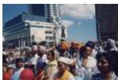
Canada Place gathering (2020_04_004_070)