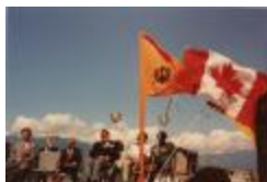
Canada Place gathering (2020_04_004_071)