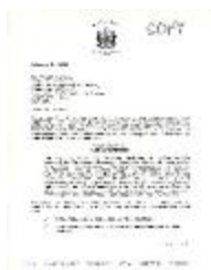
[Letter to Wendy Carter] (2020_04_004_013)