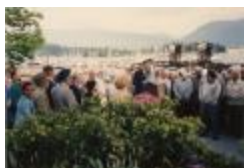
Plaque unveiling at Portal Park (2020_04_004_106)