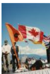
Flags on stage at the Canada Place gathering (2020_04_004_056)