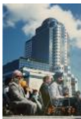
On stage at the Canada Place gathering (2020_04_004_067)