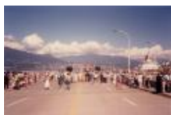
Canada Place gathering (2020_04_004_063)