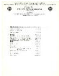
Budget planning for the Komagata Maru project (2020_04_004_010)