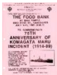
You are urged to donate to... the food bank at Sikh temple (2020_04_004_004)