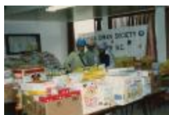
Food bank drive (2020_04_004_047)