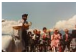
Canada Place gathering (2020_04_004_079)