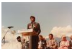
Mr. Moe Sihota M.L.A (2020_04_004_080)