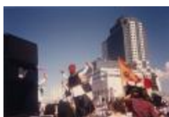
Bhangra : Richmond Punjabi Artists Assoc. (2020_04_004_102)