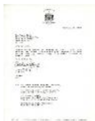
[Letter from Sandra Wilking] (2020_04_004_033)