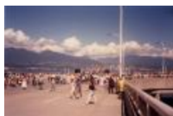
Canada Place gathering (2020_04_004_062)