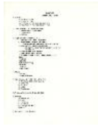
Agenda June 25, 1989 (2020_04_004_011)