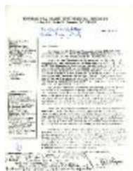
[Letter from the Komagata Maru Historical Society] (2020_04_004_017)