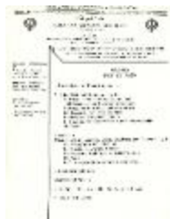
Agenda May 22, 1989 (2020_04_004_008)