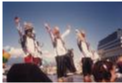
Bhangra : Richmond Punjabi Artists Assoc. (2020_04_004_105)