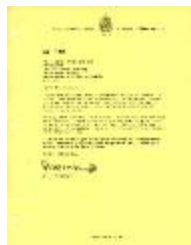
[Letter to Bikar Singh Dhillon] (2020_04_004_015)