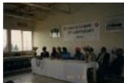
Press conference (2020_04_004_044)