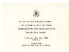
You are cordially invited to attend (2020_04_004_032)