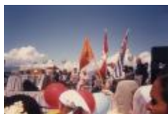
Canada Place gathering (2020_04_004_051)