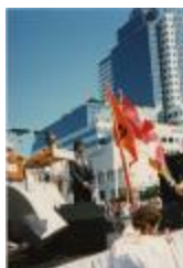
Stage at the Canada Place gathering (2020_04_004_058)