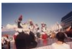
Bhangra : Richmond Punjabi Artists Assoc. (2020_04_004_099)