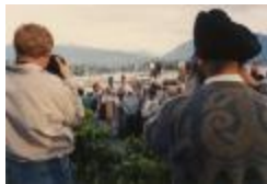
Plaque unveiling at Portal Park (2020_04_004_111)