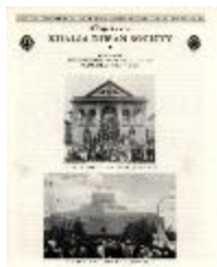
Khalsa Diwan Society (2020_04_004_036)