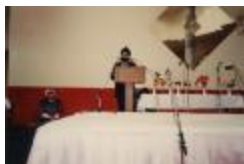
[Honouring Alderman May Wilking at Ross Street Temple, Vancouver] (2020_04_004_116)