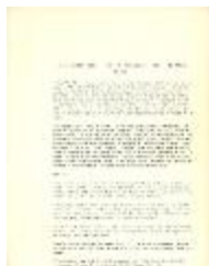
75th anniversary of the Komagata Maru incident report (2020_04_004_039)