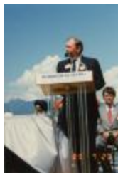
Hon. John Fraser M.P. (2020_04_004_065)