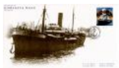
Komagata Maru incident (2020_04_003_007)