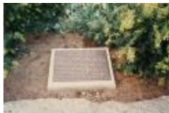
Plaque at Portal Park (2020_04_004_113)