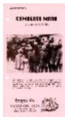
Komagata Maru a story in pictures (2020_04_004_031)