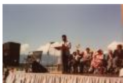
Canada Place gathering (2020_04_004_085)