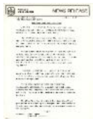
Komagata Maru day proclaimed (2020_04_004_014)