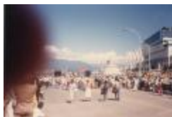
Canada Place gathering (2020_04_004_064)