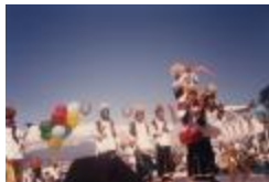
Bhangra : Richmond Punjabi Artists Assoc. (2020_04_004_104)