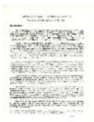
Statement of orientation and objectives (2020_04_004_018)