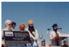
Unveiling plaque (2020_04_004_095)