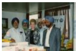
Food bank drive (2020_04_004_049)