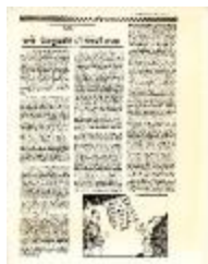
From the critical eye of uncle Vancouveria (2020_04_004_038)