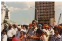
Canada Place gathering (2020_04_004_084)