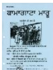
Komagata Maru a story in pictures (2020_04_004_022)