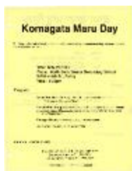
Komagata Maru day (2020_04_004_019)