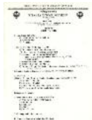
Agenda June 11, 1989 (2020_04_004_009)