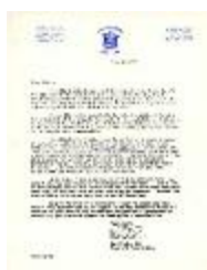
[Letter from Moe Sihota] (2020_04_004_024)