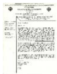
[Letter from Bikar Singh Dhillon] (2020_04_004_026)