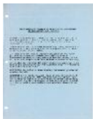
Proclamation to commemorate seventy-fifth anniversary of the Komagata Maru incident (2020_04_004_041)