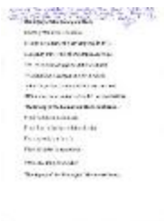
The legacy of the Komagata Maru (2020_04_003_002)