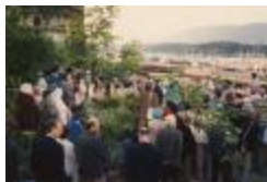
Plaque unveiling at Portal Park (2020_04_004_108)