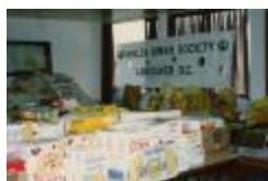
Food bank drive (2020_04_004_046)