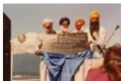
Unveiling plaque (2020_04_004_093)