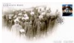
Komagata Maru incident (2020_04_003_006)