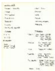
[Notes from planning of July 23, 1989 Komagata Maru anniversary event] (2020_04_004_012)