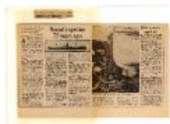
[Newspaper clippings] (2020_04_004_037)