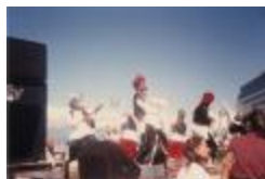
Bhangra : Richmond Punjabi Artists Assoc. (2020_04_004_089)