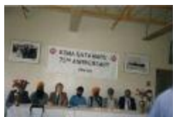
Press conference (2020_04_004_043)