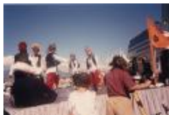
Bhangra : Richmond Punjabi Artists Assoc. (2020_04_004_103)