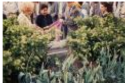
Plaque unveiling at Portal Park (2020_04_004_112)