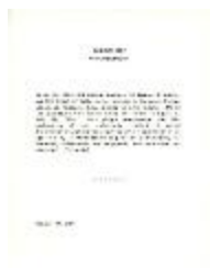
Komagata Maru 75th anniversary (2020_04_004_040)