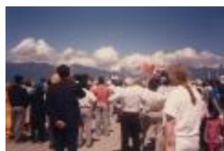
Canada Place gathering (2020_04_004_061)