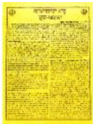
Komagata Maru tragedy (2020_04_002_001)