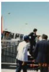
Canada Place gathering (2020_04_004_050)