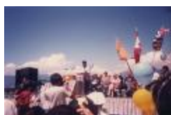
Canada Place gathering (2020_04_004_052)