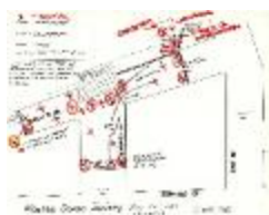
[Map for Komagata Maru 75th anniversary historical gathering event] (2020_04_004_025)