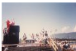
Bhangra : Richmond Punjabi Artists Assoc. (2020_04_004_100)