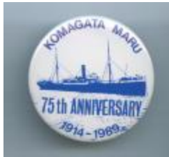
Komagata Maru 75th anniversary commemorative button (2020_04_001_002)