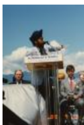
Opening by master of ceremony (2020_04_004_059)