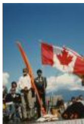
Flags on stage at the Canada Place gathering (2020_04_004_057)