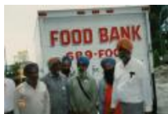
Food bank drive (2020_04_004_048)