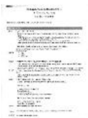
Speaker's schedule (2020_04_003_003)