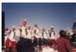
Bhangra : Richmond Punjabi Artists Assoc. (2020_04_004_101)