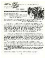
Komagata Maru photo : exhibition (2020_04_004_020)