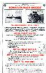
Komagata Maru incident 75th anniversary (1914-1989) (2020_04_004_005)