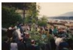
Plaque unveiling at Portal Park (2020_04_004_110)