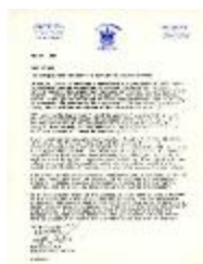
[Letter from Moe Sihota] (2020_04_004_023)