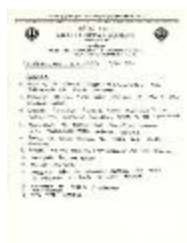
[Notes from meeting April 23, 1989] (2020_04_004_006)