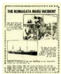
The Komagata Maru incident (2020_04_004_034)