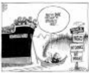
[Are you sure you want to immigrate here?] (2021_07_10813)