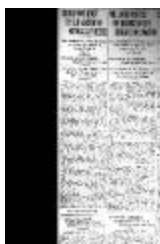
Newsclipping - Vancouver Sun: Cruiser was ready to slip anchor of Komagata if needed (2021_07_5402)