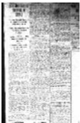
Newsclipping - Vancouver Daily Province: Bela Singh tells of shooting in temple. Page 7 (2021_07_10507)