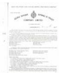
Sikhs organize Guru Nanak Mining and Trust Company (2023_17_02_003)