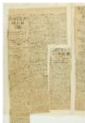
Newsclippings - Swear murder was advocated in temple; Baboo Singh committed; Bela is acquitted by assize jury (2021_07_4219)