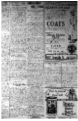
Newsclipping - Vancouver Sun: Verdict of acquittal in Bela Singh case. Page 2 (2021_07_10462)