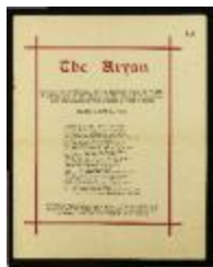
The Aryan, March - April 1912, Vol. II (2023_20_001)