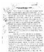
Note on the Hindu Revolutionary Movement in Canada (2021_07_5232)