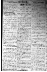
Newsclipping - Vancouver Sun: Judge advises Bela whom he sets free. Page 3 (2021_07_10463)