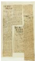
Newsclippings - Details of that Komagata riot; Hindoo strikes officer over the head with cane; Jury disagrees in Bela Singh case (2021_07_10798)