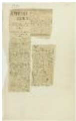
Newsclippings - Attempts to sow sedition vain; Bela Singh in box (2021_07_10799)