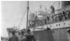
S. S. 'Komagata Maru' [and Canadian officials] (2021_07_10614)