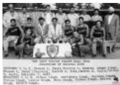
[Group photo of the Youbou Rockets at Champions of Vaisakhi 1956, Youbou, B.C.] (2023_06_01_025)