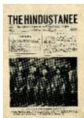
The Hindustanee: The Official Organ of the United India League. Volume 1, Number 3 (2021_07_10923)