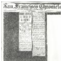
Newsclipping - San Francisco Chronicle: Hindoo suspect is taken by U.S. agents (2021_07_10424)