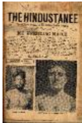
The Hindustanee. Vol. 1, no. IV (2021_07_2034)