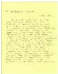
Newsclipping - San Francisco Examiner: [article on Har Dayal] (2021_07_10326)