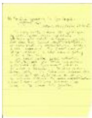
Newsclipping - Los Angeles California Times: A servant, says Dyal (2021_07_10325)