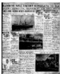
Newsclipping - Vancouver World: Rainbow will escort Komagata to sea (2021_07_5186)