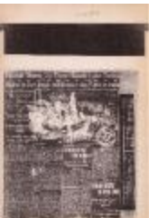
Newsclippings - Vancouver Daily Province: Hindus threw up their hands late today: ready to sail back and renew the fight in India; Found Hindus very active in London; Trouble occurs on Hindu liner (2021_07_5515)