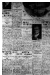
Newsclipping - Vancouver Daily Province: Local Hindus offer the money. Page 1 (2021_07_10483)