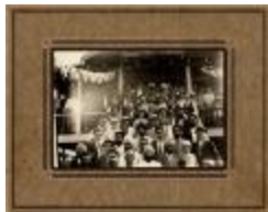
[Group on the steps of Hillcrest Sikh Temple] (2021_07_10286)