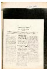
Newsclipping - Komagata Maru leaves for here (2021_07_5055)