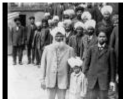
Sikh men and boy onboard the Komagata Maru (2021_05_040)