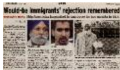
[Newspaper clipping titled, would-be immigrants' rejection remembered] (2022_01_01_03_010)