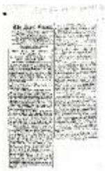
Newsclipping - The Japan Gazette: Ship full of Indians for Canada (2021_07_10433)