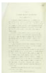
Copy of letter sent to Editor, The Daily News Advertiser, by passengers on board the Komagata Maru. Page 1-3 (2021_07_9475)