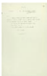
Copy of letter, unsigned, to the Immigration Agent (2021_07_10732)