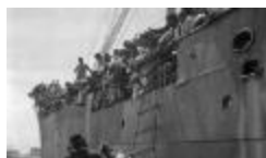
S. S. 'Komagata Maru' (2021_07_10612)