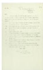
Copy of letter from Gurdit Singh to the Immigration Agent re special favours allegedly granted certain passengers (2021_07_10729)