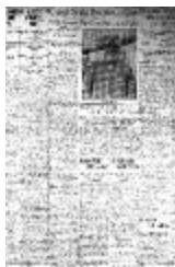
Newsclipping - Vancouver Daily Province: Gurdit Singh decides to quit: will give up contest and go (2021_07_10494)