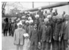
Komagata Maru incident [Gurdit Singh with passengers] (2021_07_10537)