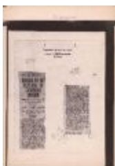
Newsclipping: Hindus to try renewal of Canadian invasion (2021_07_10532)