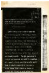
Copy of paragraph 14 of the Confidential Weekly Diary for the week ending the 13th June 1914 of the Superintendent of Police, Lahore (2021_07_4978)