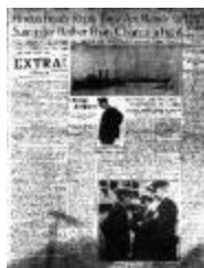
Newsclipping - Vancouver Daily Province: Extra! Hindus finally replay they are ready to surrender rather than chance a fight (2021_07_5162)