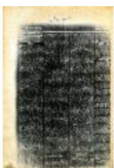
Newsclipping - The Bengalee: The lesson from Budge-Budge (2021_07_5091)