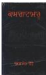
Kamagata Maru (full play) (2021_07_1495)