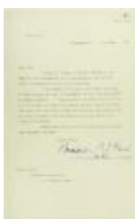
Copy of letter from Reid to Daljit Singh re responsibility for supplying food (2021_07_10682)