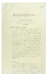
Minutes of a Hindu mass meeting held in Dominion Hall. Page 1-21 (2021_07_9506)