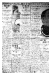
Newsclipping - Vancouver Daily Province: Hindus' ship can not show bill of health (2021_07_5132)