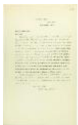
[Copy of letters enclosed with pp. 409-411 - letter from Reid to W. D. Scott re activities of J. E. Bird] (2021_07_604)