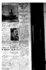
Newsclipping - Vancouver Daily Province: Maru slips out of the harbor at the hour set (2021_07_5168)