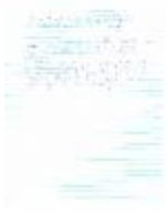
Gurdit Singh to the Immigration Agent, Vancouver (2021_07_10331)