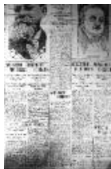
Newsclipping - Vancouver Daily Province: Lawyers engaged in Hindu tangle. Page 1 (2021_07_10484)