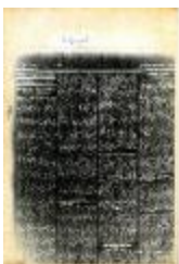
Newsclipping - The Bengalee: The Budge-Budge riot: further details (2021_07_5085)