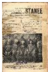
The Hindustanee. Vol. 1, no. IV (2021_07_2047)