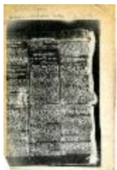
Newsclipping - Pioneer Mail: The Komagata Maru: how the ship was chartered (2021_07_10437)