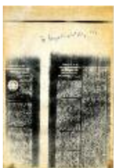
Newsclipping - The Bengalee: The Budge-Budge riot: coroner's inquest (2021_07_5095)