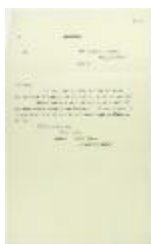
Copy of letter from Gurdit Singh to the Immigration Agent re calling before the Board of Enquiry (2021_07_10701)