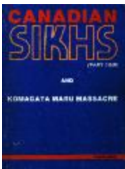
Canadian Sikhs (Part One) and Komagata Maru Massacre (2021_07_6295)