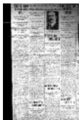
Newsclipping - Vancouver Daily Province: Gurdit Singh won't pay up: what will Komagata do now? Page 1 (2021_07_10479)