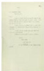
Copy of letter from the passengers on S. S. Komagatu Maru to the Immigration Agent re lack of water (2021_07_10708)