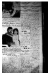
Newsclipping - Vancouver Daily Province: Is bound to feed seditious flames (2021_07_10481)