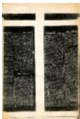
Newsclipping - Pioneer Mail: Current comments (2021_07_10441)