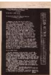
Newsclipping - China Press of Shanghai: Gurdit Singh sails on Tuesday with 400 whose entry Dominion opposes (2021_07_5506)