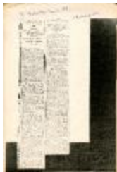
Newsclipping - Montreal Daily Star: Officials watch Japanese steamer; All precautions taken (2021_07_10426)