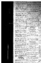
Newsclipping - Vancouver Daily Province: Live and let live (2021_07_10495)