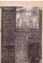
Newsclipping - Vancouver Daily Province: [re Gurdit Singh] (2021_07_5512)