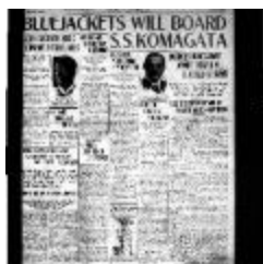
Newsclipping - Vancouver World: Bluejackets will board S. S. Komagata (2021_07_5180)