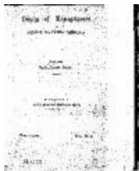
Voyage of Komagatamaru or India's Slavery Abroad (2021_07_8343)