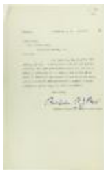
Copy of letter from Reid to Gurdit Singh re provisioning (2021_07_10690)