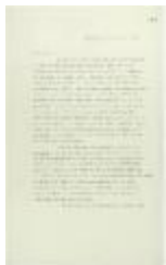
[Correspondence re recent incidents (see pp. 381-385)] Page 1-3 (2021_07_320)