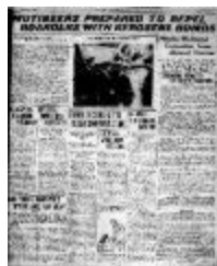
Newsclipping - Vancouver World: Mutineers prepared to repel boarders with kerosene bombs (2021_07_5183)