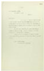
Copy of letter from Daljit Singh to the Immigration Agent (2021_07_10705)