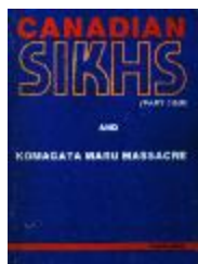
Canadian Sikhs (Part One) and Komagata Maru Massacre (2021_07_6295)