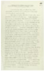
Statement by Mewa Singh (see p. 647). Page 1-2 (2021_07_2294)