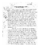
Note on the Hindu Revolutionary Movement in Canada (2021_07_5232)