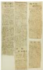
Newsclippings - Serious charge against Hindus; Charge of murder laid against Hindu; Hindu sues bank, queer story told; Three more Hindus (2021_07_10803)