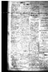
Newsclipping - Vancouver Daily Province: Hindus here rise to protest. Page 24 (2021_07_10511)