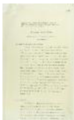
Minutes of a Hindu mass meeting held in Dominion Hall. Page 1-21 (2021_07_9506)