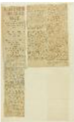
Newsclipping - Rahim suggested the murders say witnesses (2021_07_10806)