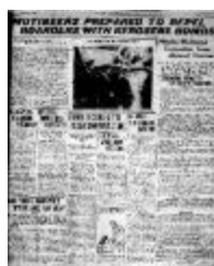
Newsclipping - Vancouver World: Mutineers prepared to repel boarders with kerosene bombs (2021_07_5183)