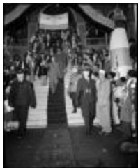
Nehru with daughter Indira Gandhi at the Sikh Temple in Vancouver (2021_07_10520)