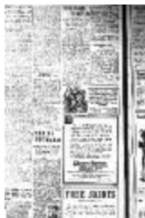
Newsclipping - Vancouver Daily Province: Reserved judgment in the Rahim case. Page 8 (2021_07_10513)