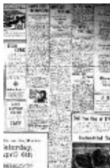
Newsclipping - Vancouver Daily Province: Rahim is sent up for trial. Page 3 (2021_07_10512)