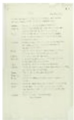
Copy of conversation between Hindus re Reid and Hopkinson (2021_07_10717)